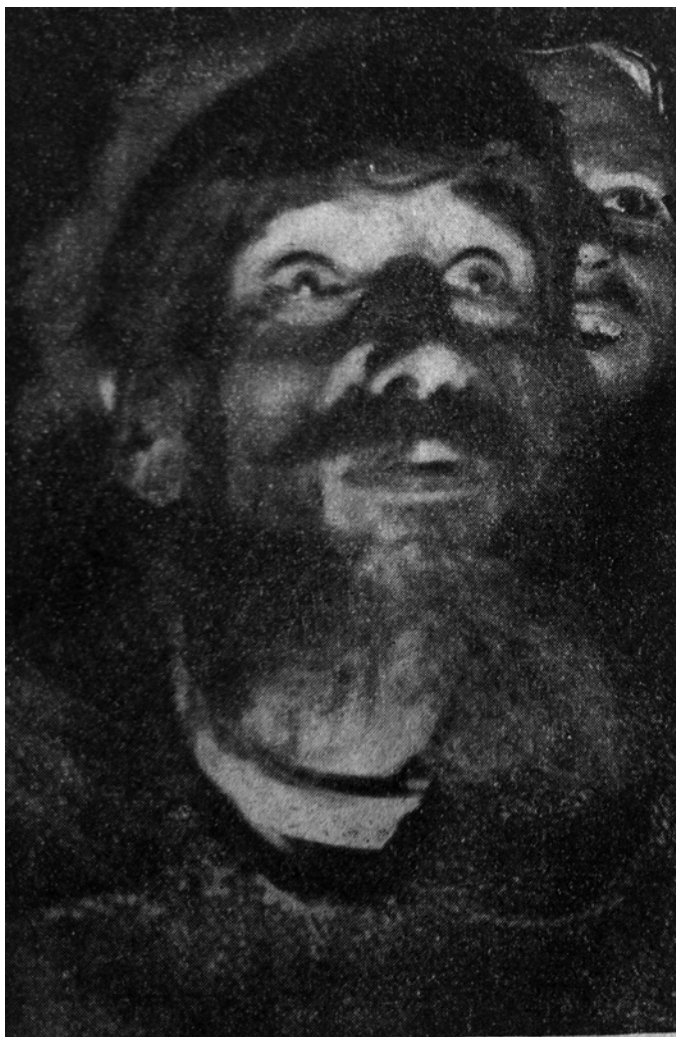
Figure 3. A. Katsigras's photographs of peasants' reactions during a screening. Featured in his article "Izuchenie kino-zritelia," Sovetskoe iskusstvo , no. 4–5 (1925): 58–63.

theater loges that would be stocked with a wide array of clinical equipment to scientifically record "stimulations, physiological processes, and reactions." 40 The use of biomedical examining equipment to study the viewer's internal physiological changes was underway by the end of the 1920s. The "laboratory for the study of mass psychology," founded in 1929 at the Russian Theatrical