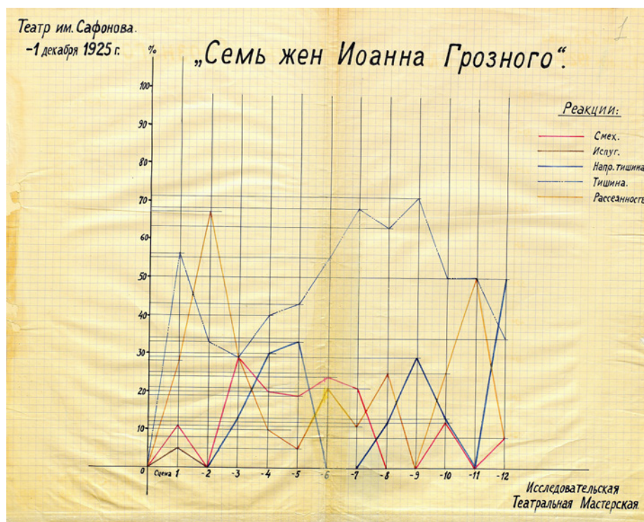
Figure 2. The Theatre Research Workshop’s graph of audience reactions to a production of The Seven Wives of Ivan the Terrible (1925). RGALI, f. 645, op. 1, d. 312, l. 1.

with solemnity, “should not occupy less than 70% of overall audience reactions (otherwise the performance will be boring), providing that the overall number of moments of laughter is not less than thirty per hour and that the total number of audience reactions is not less than fifty per hour.” 38