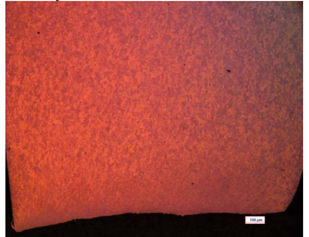
Fig. 3. CP Ti Sheared, as polished viewed in polarized light and sensitive tint, 5X objective