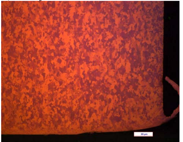
Fig. 4. CP Ti Band saw, as polished viewed in polarized light and sensitive tint, 5X objectiv