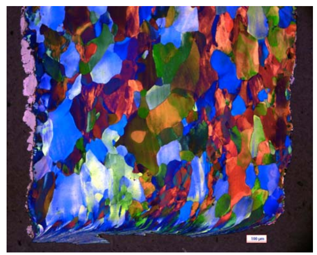
Fig. 1. 99.98 Fe sheared, etched with Klemm's I, 5X objective.