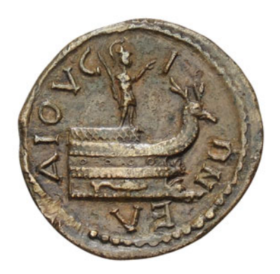
Figure 3. Reverse of Elaean coin (ca 184–90 CE) showing Protesilaus armed aboard his ship. (Obverse: portrait bust of the emperor Commodus.) Inv. no. 18235375. Münzkabinett, Staatlichen Museen zu Berlin.

From this angle, the numinous heroic past looks rather 'sublime', and the Heroicus would seem to slot into the practice of pious cultural commemoration.<sup>10</sup> Cult statuary played a pivotal role in this arena, for obvious reasons. Statues preserve the look and feel of the past in a way that texts and myths cannot: they 'presence' the once vital past and give beholders direct access to it, endowing it with a seemingly incontestable legibility and a credibility that not even ruins can rival. In this cultural framework, seeing is believing,<sup>11</sup> and hapticity, the ability to touch what one sees, makes the experience irresistibly palpable: it anchors belief in the body and confers on it the touch of the real.<sup>12</sup> That said, there are simply too many signals in the Heroicus warning us not to take the language of ritual and cult, and certainly not its descriptions of statues, at face value.<sup>13</sup>