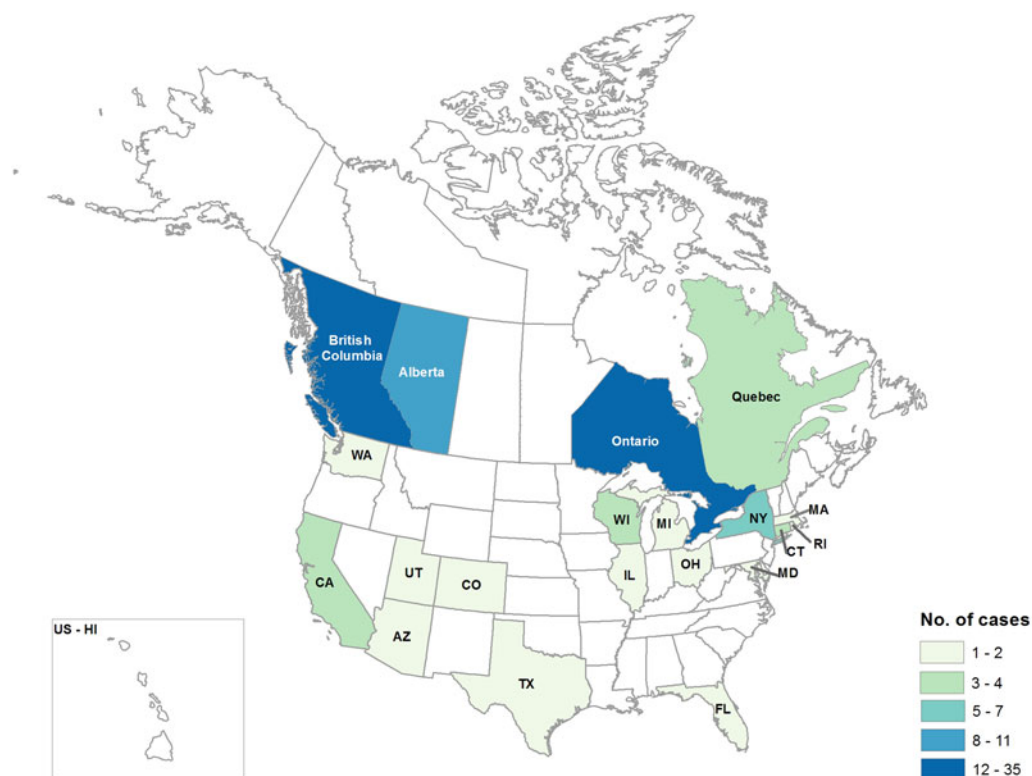
Fig. 2. Persons infected with the outbreak strains of Salmonella Newport, S. Hartford , S. Saintpaul , S. Oranienburg , and coinfecting with S. Newport and S. Hartford in the USA and Canada by state and province, 2013–2014, ( n = 94 ) (case count map) USA: Arizona (1), California (4), Colorado (1), Connecticut (3), Florida (1), Illinois (2), Maryland (1), Massachusetts (1), Michigan (1), New York (7), Ohio (1), Rhode Island (1), Texas (2), Utah (1), Washington (1), and Wisconsin (3); Canada: Ontario (35), British Columbia (14) Alberta (10), and Quebec (4).