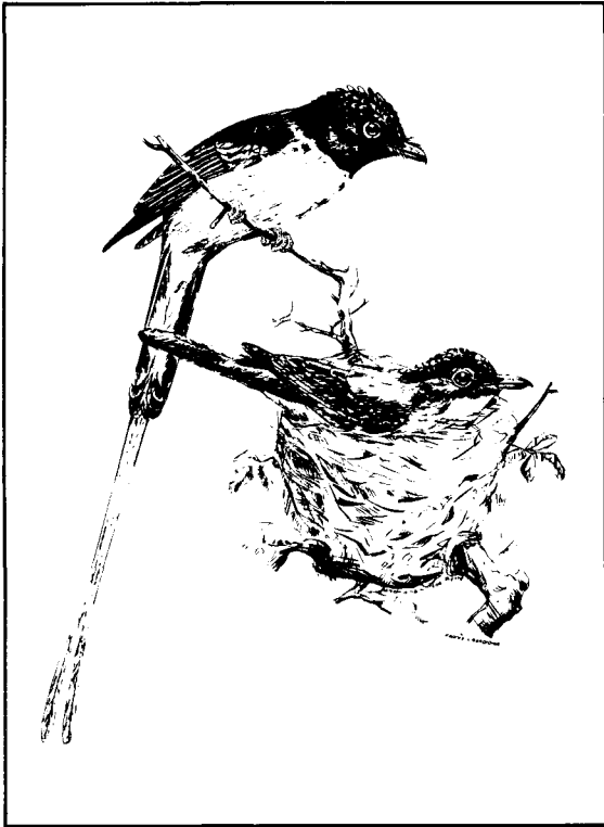
Madagascar paradise flycatcher (from Madagascar , published by Pergamon Press).

facilitate the exchange of information and expertise on the captive biology of Macaca silenus , to assess its conservation needs in the wild, and to formulate a programme of information exchange and co-operation to ensure the certain survival of this endangered primate.