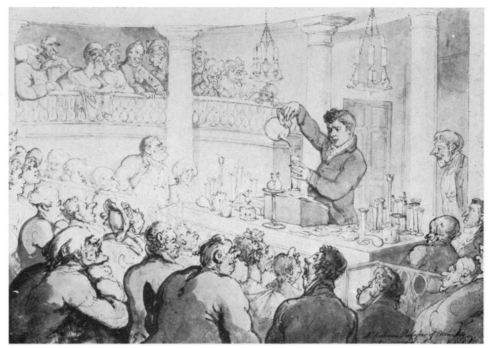
Figure 1. 'Mr. Acchum . . . lecturing at the Surry Institution.' Coloured pen drawing by T. Rowlandson, 1809.