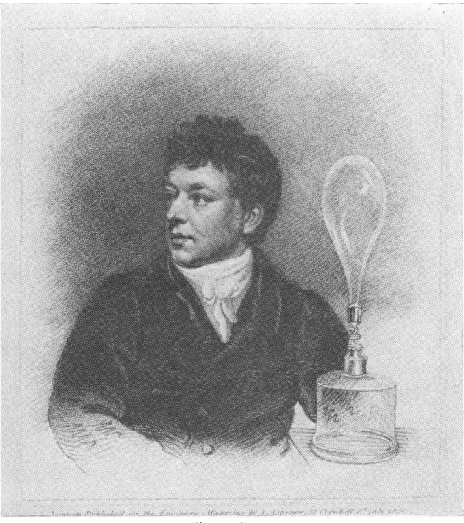
Figure 4. Portrait of Accum by J. Thomson for the European Magazine, 1810.