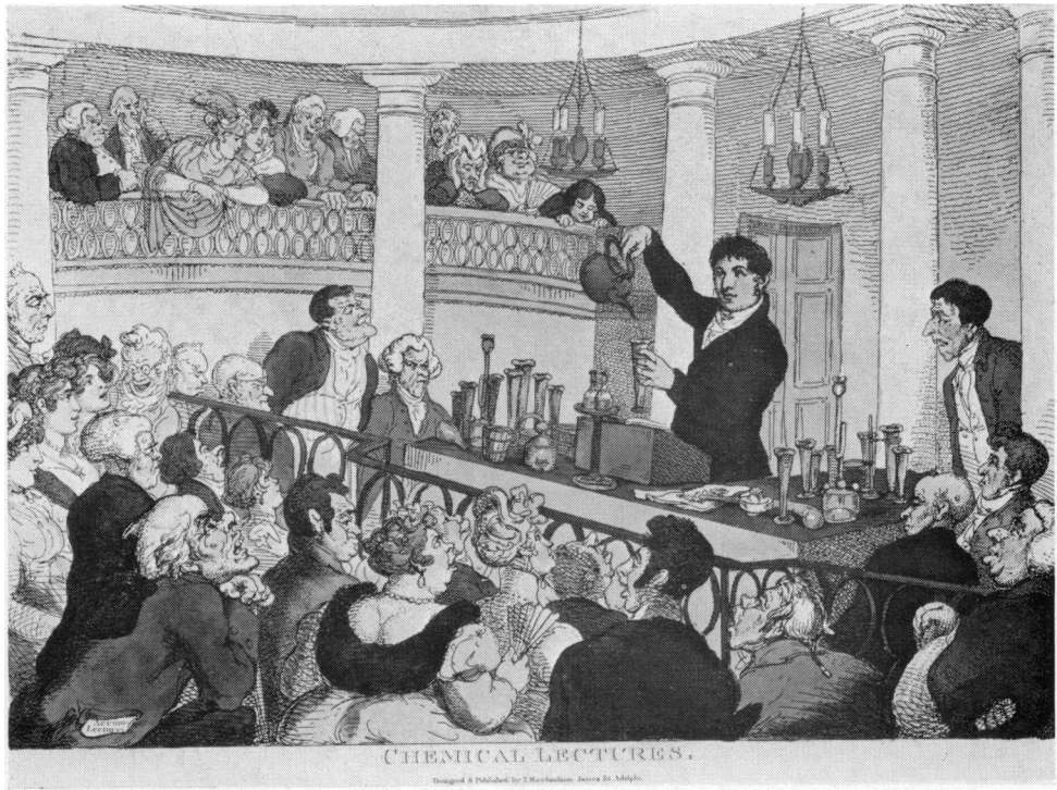
Figure 2. Chemical Lectures. Coloured engraving by T. Rowlandson, c. 1810.