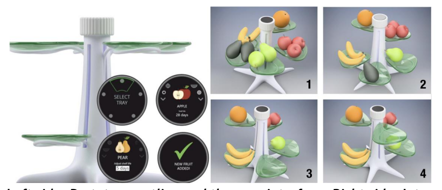
Figure 2. Left side: Prototype outline and the user interface; Right side: Interaction flow

In the second part, all participants were presented with a scenario of them arriving at home with purchased fruits to store. To be specific, the users were invited to navigate in a kitchen scenario (in the first-person view) and to interact with the virtual prototype. The interaction session consists of several steps: placing fruits on the leaf-trays; selecting the branch and fruit category by interacting with the user interface; setting the expected time of consumption according to the suggested life span. Upon the placement of the set-up, the fruit starts moving down along the tree trunk. Finally, an empty tray will return to its top position (The interaction flow of the prototype is shown on the right side of Figure 2).