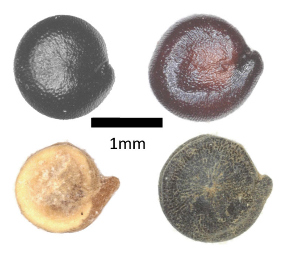
Figure 1. Chenopodium berlandieri polymorphic seeds and domesticated landraces: (top left) black, thick-testa morph; (top right) red, thin-testa morph, seeds from modern population CB004 (see text for details). Pericarps have been removed. Note the characteristic alveolate (honeycomb) texture on both morphs. Bottom left: typical pale-domesticated-variety seed from an intact inflorescence at Holman rockshelter, Arkansas (see Fritz 1984; Wilson 1981). Bottom right: A typical C. berlandieri ssp. jonesianum seed from the Edens Bluff bag, Arkansas (Fritz 1986; Fritz and Smith 1988). (Color online)