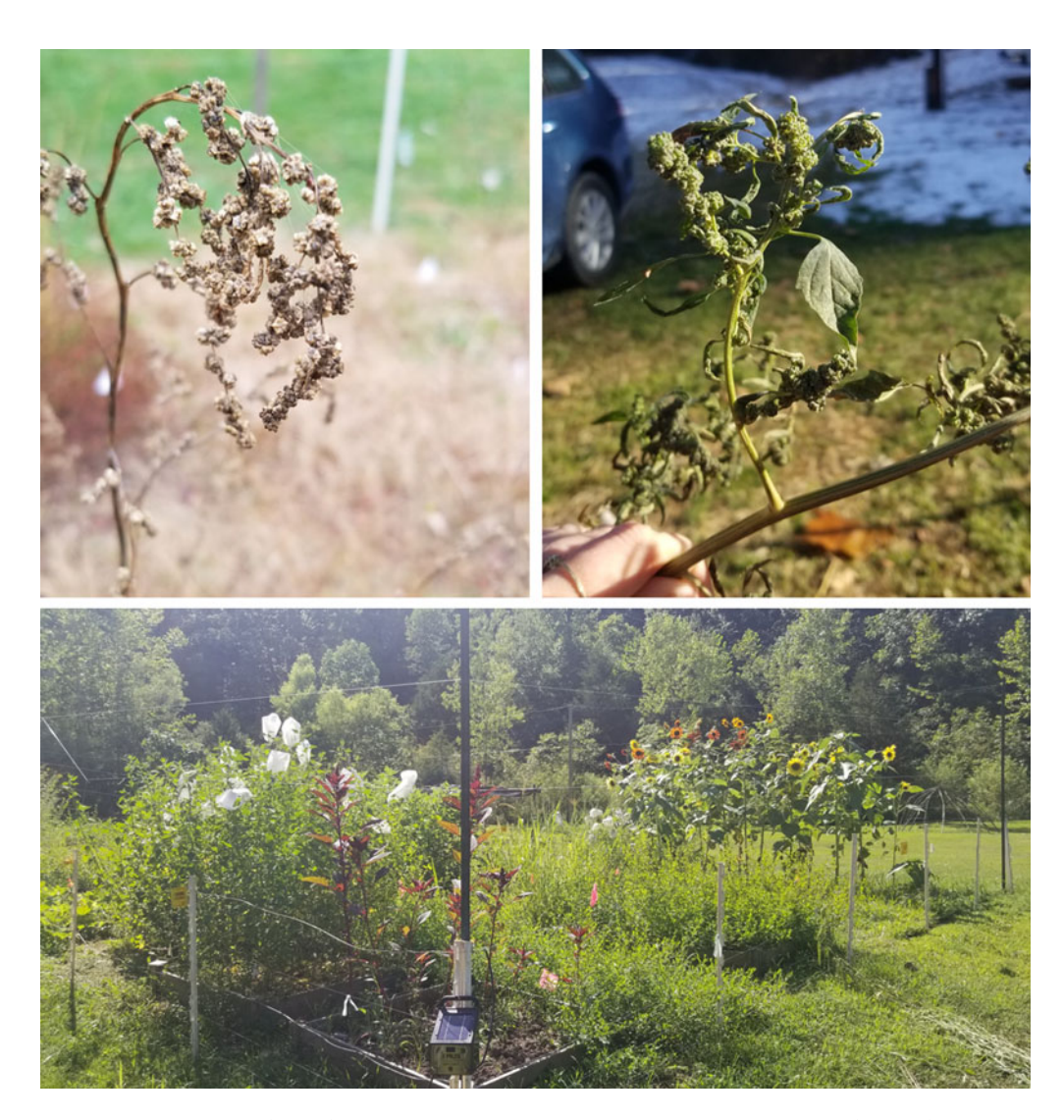
Figure 3. Experimental garden: ( top left ) an example of a fully senesced plant harvested on October 28; ( top right ) an example of a plant harvested before senescence on November 15; ( bottom ) a view of the garden environment in mid-August. The Chenopodium plants are on the left with the white isolation bags on their branches. (Color online)

measuring 1.2 m<sup>2</sup>, split into four quadrants to distribute plants from both populations evenly across the bed, and they were watered as needed for two weeks after transplanting. Soil in the raised beds was a mixture of commercial topsoil and compost. Plants were surrounded by an electric fence to prevent predation, and the bed was kept weeded so that there was no competition from other plants. Each plant was measured and scored for phenology on a weekly basis from June to October of 2019. Mueller harvested plants as they senesced, beginning on October 28, 2019. She considered plants with dry and brittle leaves and stems and with no remaining flowers to be senesced (Figure 3). On November 16, Mueller harvested all remaining plants, including those that were not yet senesced, because the first heavy snow was forecast. This procedure serendipitously resulted in a sample of five harvests from senesced plants and five harvests from not yet senesced plants from each population.