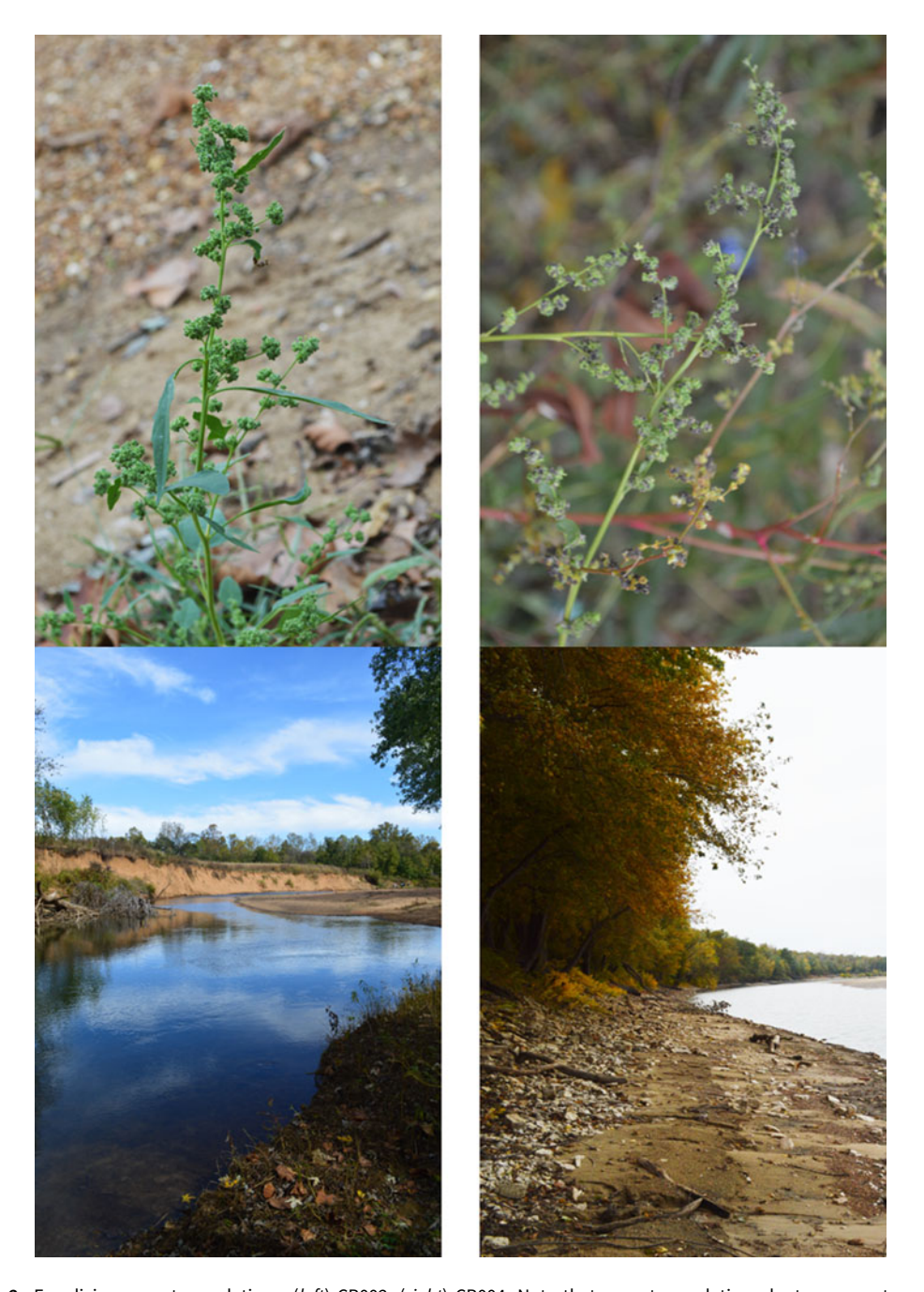
Figure 2. Free-living parent populations: ( left ) CB002, ( right ) CB004. Note that parent population plants were not senesced when harvested. Compare with offspring in garden environment illustrated in Figure 3. (Color online)

In the spring of 2019, a 1.5 mL random sample of seeds from each seed lot was cold stratified in distilled water for one month at 4°C (March 20–April 23, 2019) to begin the germination process. Next, seeds were lightly pressed into moist potting soil—one seed per cell in 72 cell trays—and placed on a mist bench in the greenhouse at Washington University under light for 12 hours/day. After approximately six weeks, on June 6, 2019, Williams transplanted 10 seedlings from each population into a raised bed at the Center for American Archaeology in Kampsville, Illinois (Figure 3). Ten plants (replicants) from each C. berlandieri population were planted at intervals of 16.5 cm in a raised bed