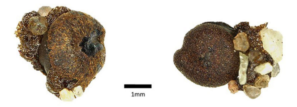
Figure 5. An example of a "popped" and carbonized seed from one of our carbonization experiments. Most of the seeds labeled "popped" broke into two pieces (two halves of the testa) and left the inner perisperm and embryo exposed. Granules of sand are attached to the exposed inner parts of the seed. (Color online)

p = 0.7828), but both had much higher mean sample proportions of red morphs than their parent populations. Statistical tests could not be performed to compare parent population to garden population, given that each parent population is a sample of one, but in both cases, the sample proportion of the free-living parent population was lower than the entire range of variation for the harvests from its offspring in the garden (Figure 4).