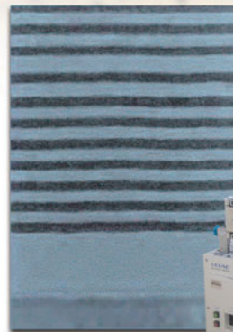
Iron and carbon multi-layer film.