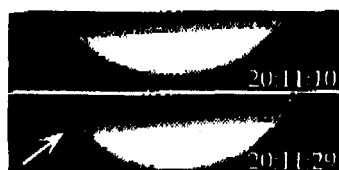
Fig.1 ImpactA Precursor 16 July 1994, 20:11:29 UT

Coordination and communication between all three telescopes proved invaluable in tracking and identifying these dynamic events. The MAGIC team continued to monitor the structure and evolution of the impact sites for approximately a week after the last fragment struck the planet, (and intermittently for the subsequent two months).