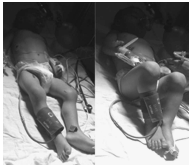
Figure 1. Episodes of atypical movements and discomfort (night) compared to baseline lethargy (left).

While in the PICU, his GCS remained 8/15, but he began having intermittent episodes of athetoid-like movements involving all four limbs lasting approximately 5–10 minutes (Figure 1). It was unclear whether these were seizures, so in the absence of an electroencephalography, the neurology consulting service recommended loading him with 20 mg/kg of phenytoin. Despite this, he continued to have these intermittent movement episodes while looking uncomfortable. Given that all investigations failed to explain the child’s abnormal level of consciousness, the diagnosis of intussusception was entertained, despite the absence of any obvious gastrointestinal symptoms.