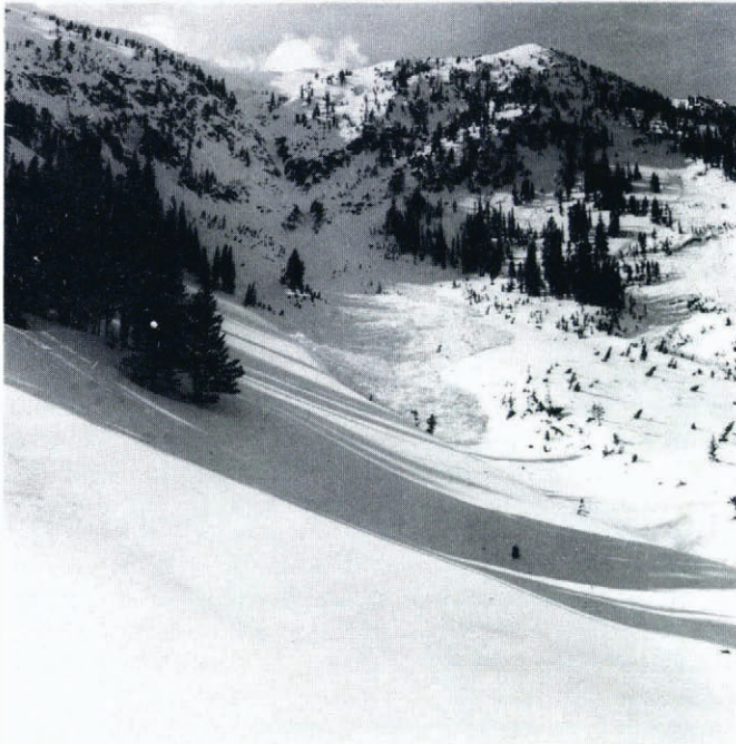
Fig. 4. Slushman avalanche in run-out zone.

for viscous, incompressible fluid flow. The two-step code predicts velocity and pressure initially using the non-linear Navier–Stokes equations, then uses a linear approximation to these equations to move material iteratively through the grid as the fluid advances. Boundary conditions are of the ordinary fluid-dynamics type except at the bottom surface where a slip condition is imposed, based upon a specified friction coefficient f . The other basic fluid parameter that must be specified is the kinematic viscosity, \nu . Geometric input to the code is the center-line profile of the avalanche path, which may be taken from topographic maps as shown in Figure 1. For the Brooklyn B avalanche, which had a significant mixed-motion component and a low snow density \rho (estimated 200–250 kg m -3 ), the relatively low values of \nu = 0.35 \text{ m}^2 \text{ s}^{-1} and f = 0.35 result in a reasonable fit to the observed avalanche flow. The Slushman avalanche (Fig. 4) is more complex, in that snow in the starting zone was dry