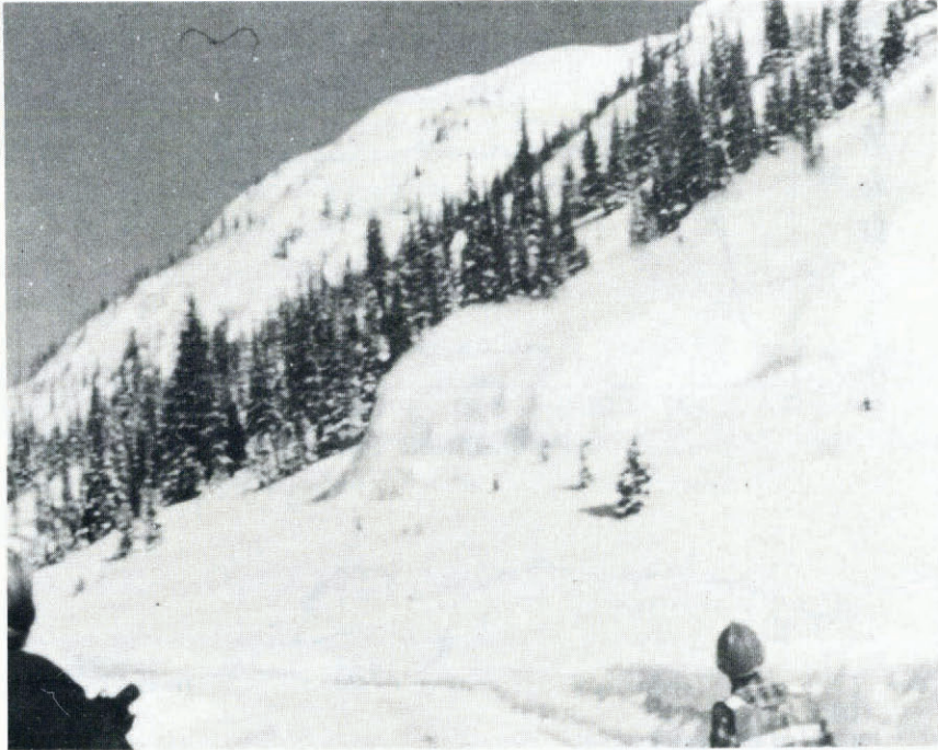
Fig. 3. Brooklyn B avalanche approaching road.