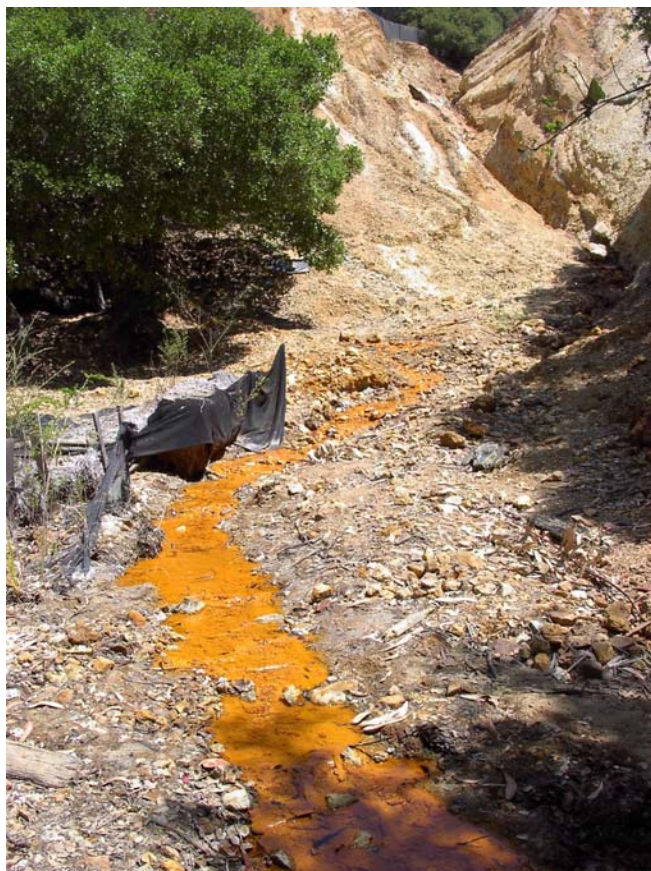
Fig 1. Leona Heights sulfur mine tributary to Lion Creek