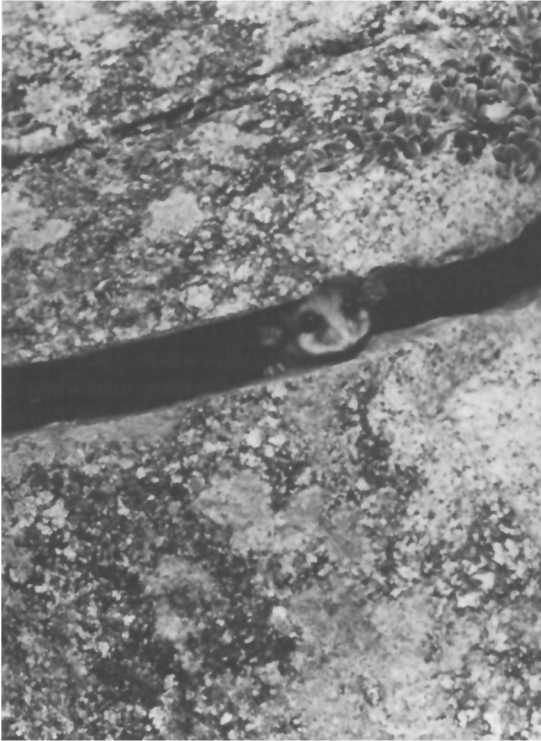
Mountain pygmy possum, runner-up in 'Endangered Wildlife'.