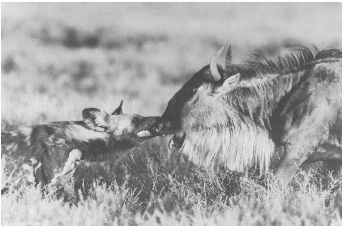
Wild dog attacking wildebeest by Jonathan Scott, Wildlife Photographer of the Year 1987.

Details of the 1988 competition are available from BBC Wildlife Magazine, Broadcasting House, Whiteladies Road, Bristol BS8 2LR, UK.