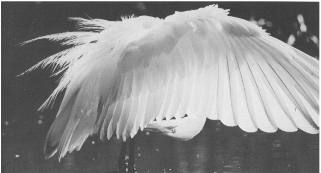
A great egret preening by Stan Osolinski, winner of 'Animal Behaviour — Birds'.