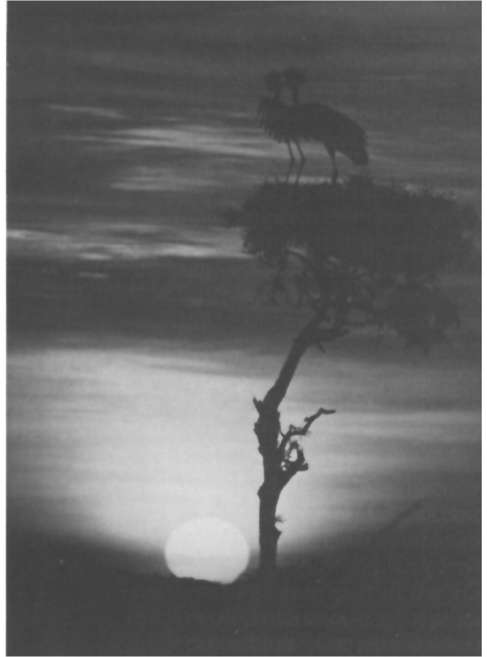
Two crowned cranes at dawn by David Breed, runner-up in 'Dusk to Dawn'.