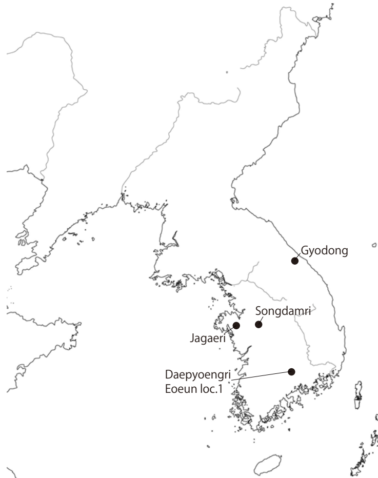
Figure 1 Region of northeast Asia and the archaeological sites referred in this paper

ing pits of which we can identify the chronological phase from the structure of the dwelling pit itself and from the associated pottery. The results are 2860 \pm 20 BP (PED-11437) for Gyodong dwelling pit 1, 2720 \pm 20 BP (PED-11435) for Songdamri dwelling pit KC-001, and 2480 \pm 20 BP (PED-11436) for Jagaeri dwelling pit 48, respectively (Table 1). These data correspond with the chronology developed by the author (Figure 2).