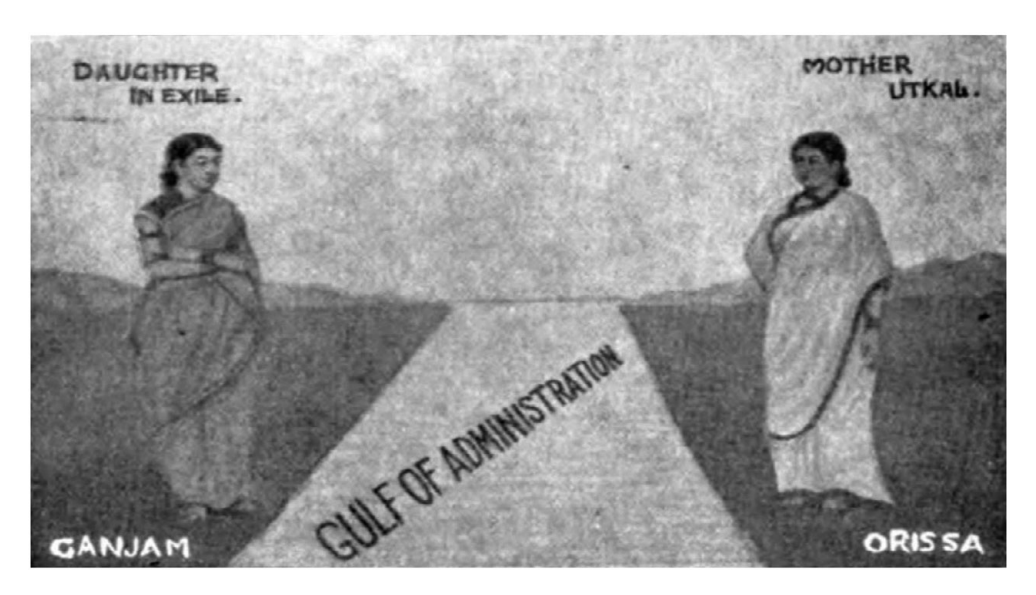
Figure 1. Mother Utkala.

These questions deeply agitate and perturb the heart as we look at the face of Odia. Utkala Sammilani was established to solve this national problem, and the purpose of the Odia , the mouthpiece of Utkala Sammilani, is the same. The only national desire of the Oriyas is union. (Das 1917, 280)