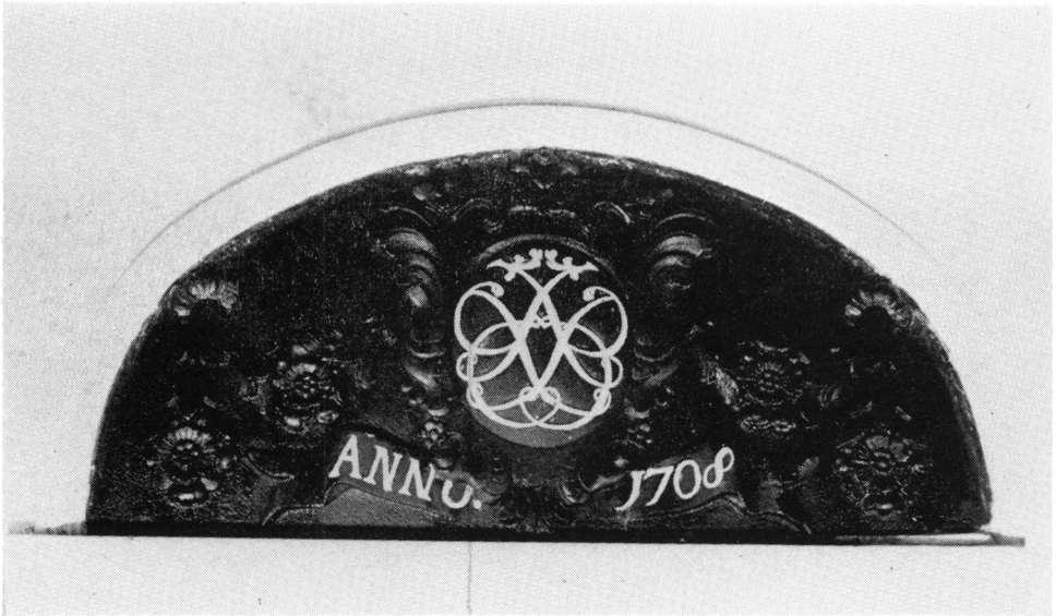
Figure 2 The stone inscription bearing the monogram of Governor Hendrick Becker. This stone inscription may be seen at the entrance to the administration building of the Government Leprosy Hospital, Hendale.