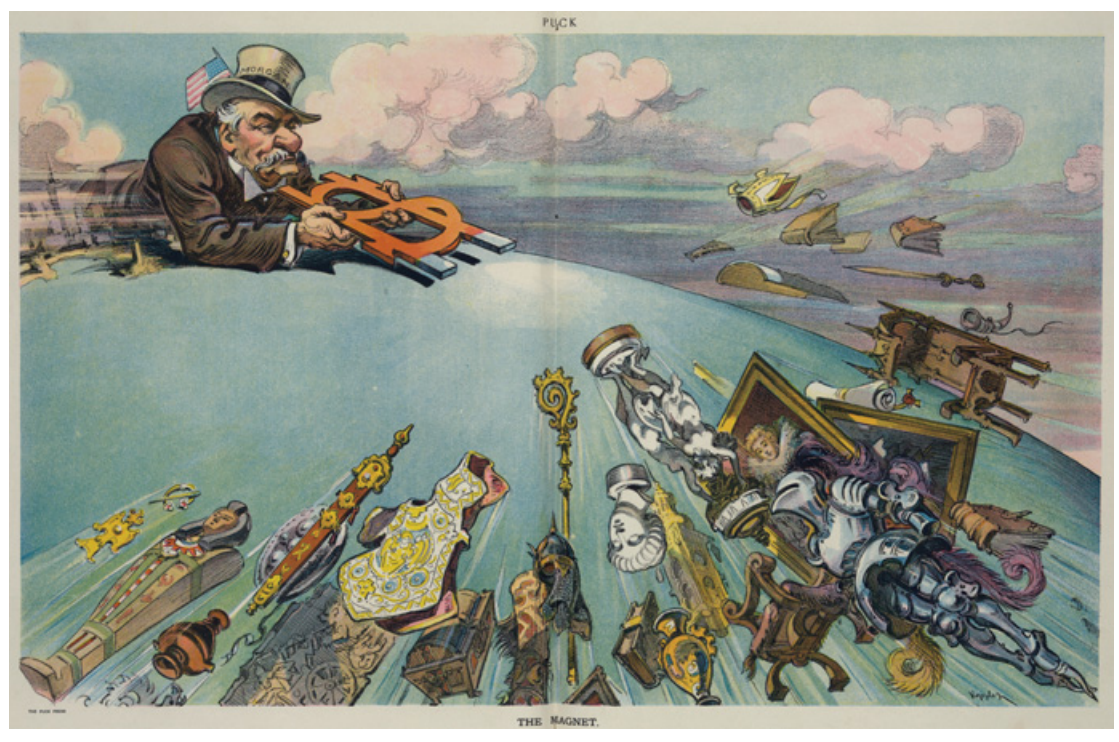
Figure 1 U. J. Keppler, 'The Magnet', Puck, 21 June 1911