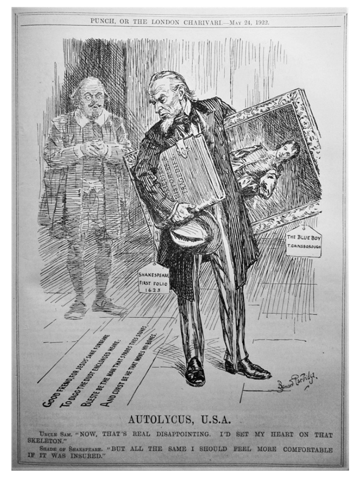
Figure 2 B. Partridge, 'Autolycus U.S.A.', Punch, 24 May 1922

prompted the creation of organisations including, in 1903, the National Art-Collections Fund (NACF), to try to address the perceived