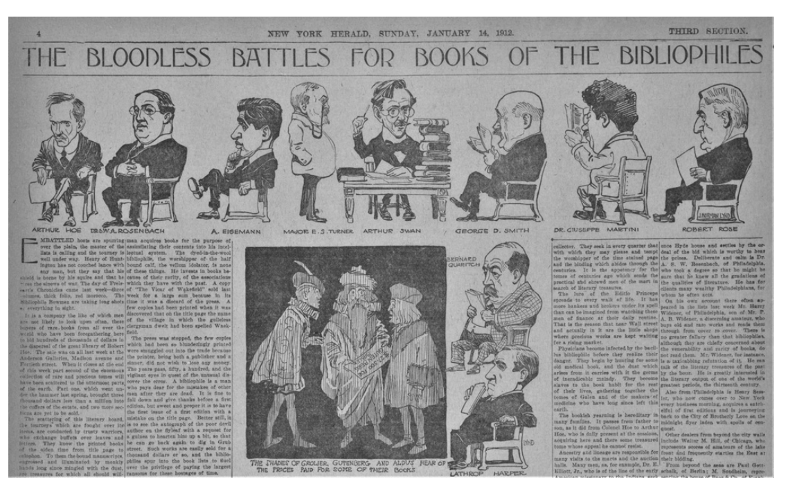
Figure 3 J. N. Lynd, 'The Bloodless Battles for Books of the Bibliophiles', The New York Herald, 14 January 1912