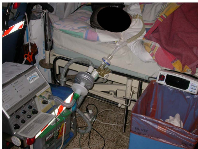
Measurements were taken proximal and distal to the filter.

Respiratory physiological parameters were measured using a Capnomac Ultima ventilation monitor (Datex-Ohmeda Inc., Madison, WI) and a Nellcor pulse-oximeter (Tyco International Inc., Princeton, NJ). Ventilation airflow parameters were measured using a Ventcheck respiratory mechanics monitor (Novamatrix Medical Systems Inc., Wallingford, CT).