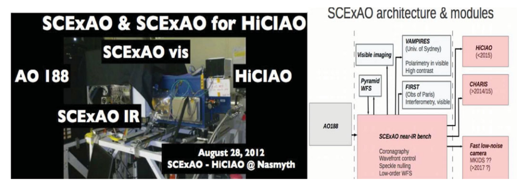
Figure 2. SCExAO as configured in Phase 1 (left) and Phase 2 (and beyond) (right).

ring), but real and persistent. Speckle nulling reduces the combined image's standard deviation over the entire frame by \sim one-half. Inside the control region (boxed region), speckle nulling lowers the image standard deviation by about a factor of \sim 7. Thus, at the smallest angular separations (2-4 \lambda /D), speckle nulling alone improves our detection limits by \approx 1-2 magnitudes (Martinache et al. 2013, in prep.).