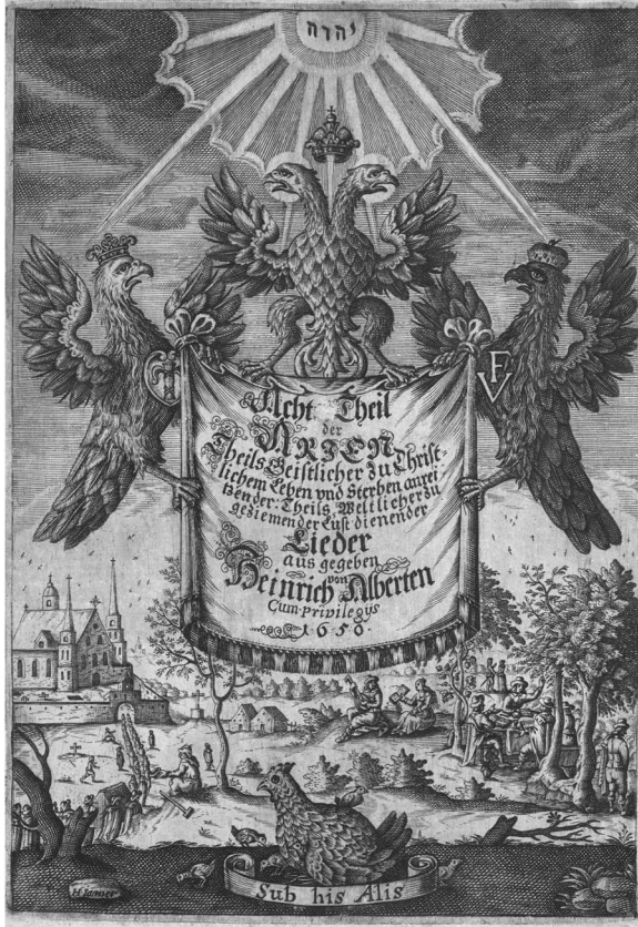
Figure 2 Engraved title page of Heinrich Albert, Achter Theil der Arien (Königsberg, 1650). British Library, G.61. By permission of the British Library Board

authority from which these secular princes drew their power. Under the eagles' wings are stylised scenes that represent the poetic world of the Arien : on the left, a funerary procession entering the city gates, and on the right, a convivial garden scene with musicians around a table and a lutenist and female singer. The theme of protection is reinforced by the nesting hen in the lower foreground, whose chicks are surrounded by the text 'Sub his alis' ('under these wings'), an allusion to Psalm 90:4 and its promise of God's shelter. 152 Just as the hen protects her chickens, so too do the princely eagles guard Albert's sense of ownership over his Arien . The eye-catching iconography reassured purchasers that this