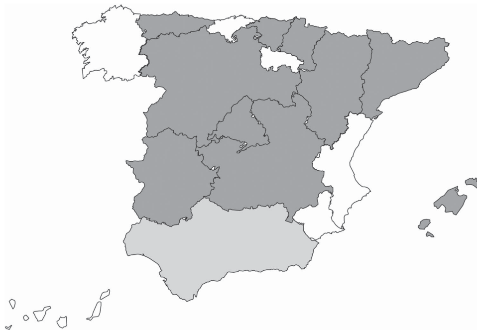
Fig. 1. Map of Spain with regions of study. ■, Study completed; □, partial study; □, region not studied.