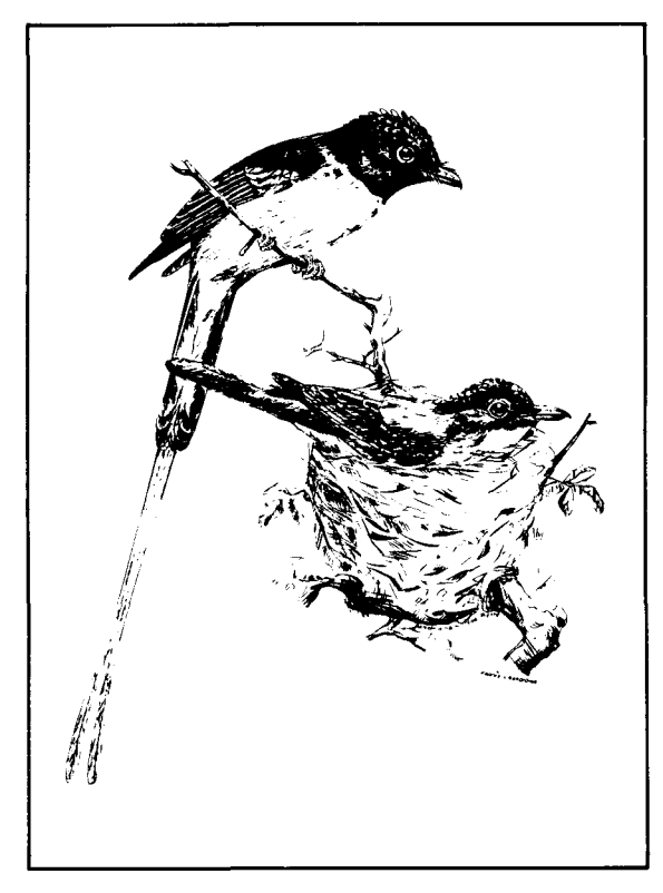
Madagascar paradise flycatcher (from Madagascar , published by Pergamon Press).

facilitate the exchange of information and expertise on the captive biology of Macaca silenus , to assess its conservation needs in the wild, and to formulate a programme of information exchange and co-operation to ensure the certain survival of this endangered primate.