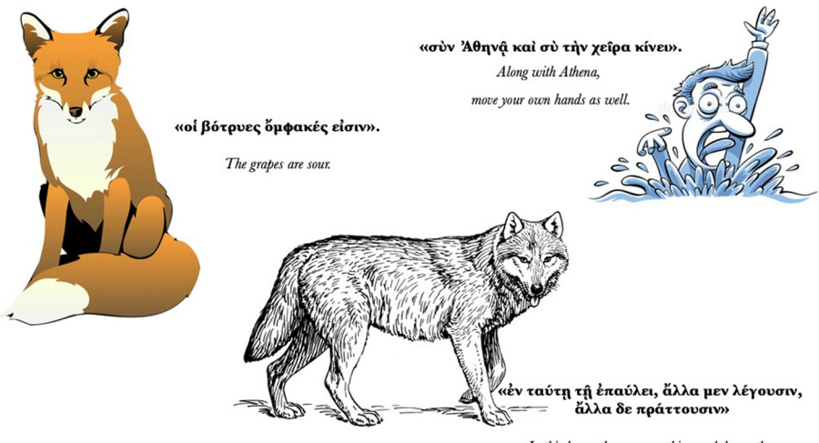
In this house they say one thing and do another.