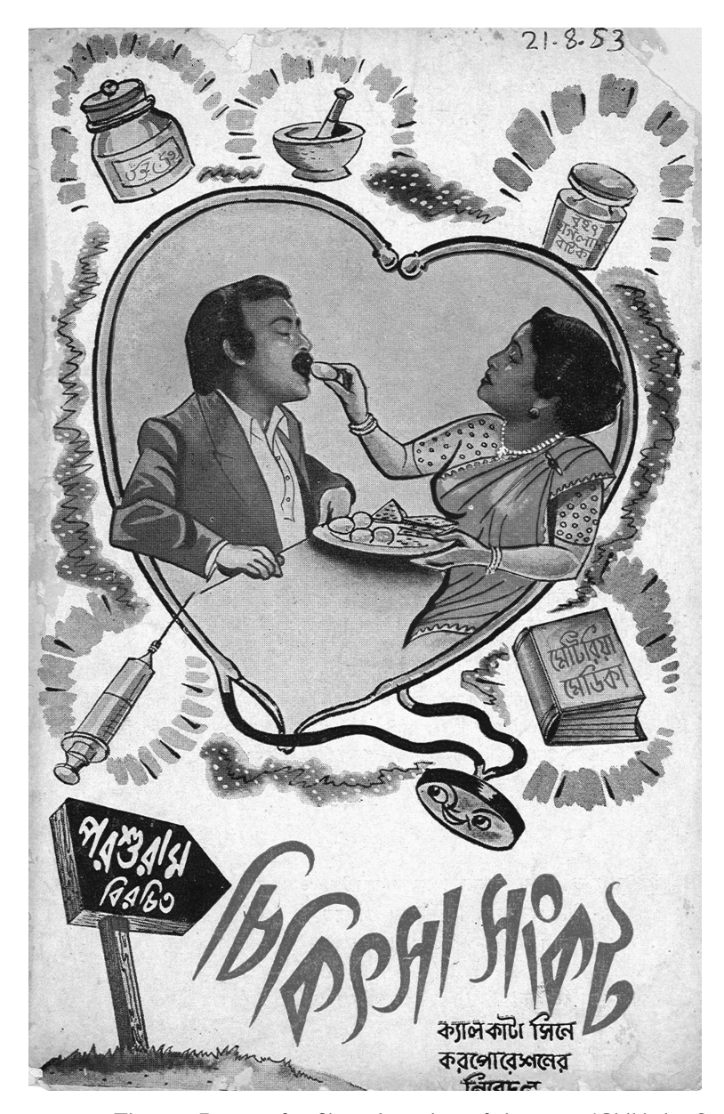
Fig. 1.1 Poster of a film adaptation of the story 'Chikitsha Sankat' ('Crisis of Treatment') by Rajshekhar Basu, produced by the Calcutta Cine Corporation in 1953. Reproduced from the collection of the Archives of the Centre for Studies in Social Sciences, Calcutta.