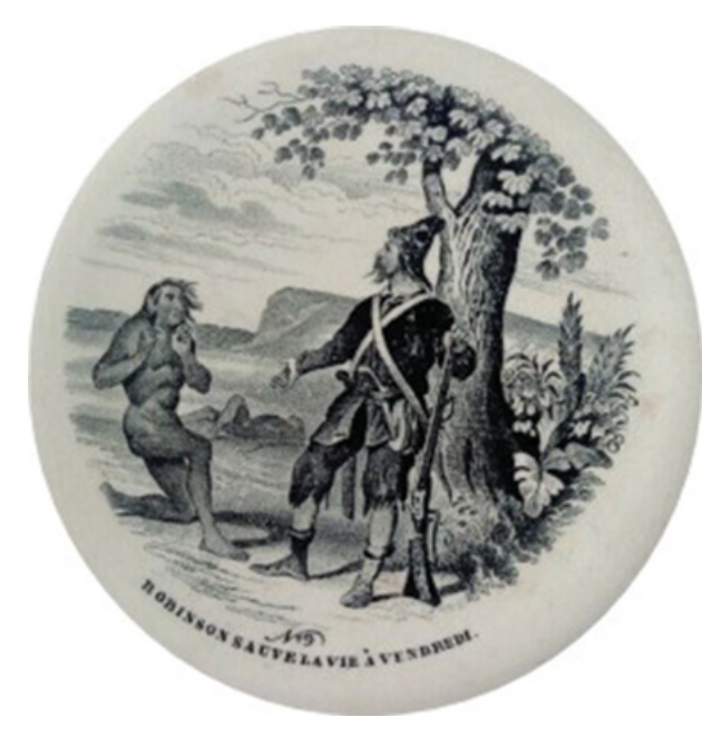
Figure 28 Transfer print on Creil-Montereau plate '[Robinson encountering Friday]', c. 1850 (diameter: 22 cm).

circular well, the illustration on plate 9 of the Creil-Montereau set compresses the composition on the horizontal plane: it positions Friday much more closely to Crusoe than Grandville had done, their feet almost touching. This reduction in the distance between Crusoe and Friday affects the way in which their relationship can be understood because even though he is fearful of his future master, Friday is physically close to him. This proximity suggests that their relationship will soon change, a change already signalled by Crusoe leaning on his rifle rather than holding it. He does not consider Friday a threat and invites his confidence with his hand gesture.