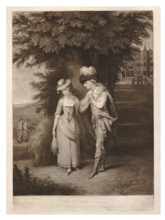
Figure 16 Mezzotint depicting Palemon and Lavinia (50.2 × 35.7 cm), designed by William Lawrenson and engraved by John Raphael Smith, 1780.

Lawrenson had previously centralized in a painting that he exhibited at the Royal Academy exhibition of 1780 entitled 'Portrait in the character of a haymaker' (p. 7).<sup>25</sup> The print was issued as a mezzotint in two states, in monochrome and as a delicately hand-coloured version (Figure 16).<sup>26</sup> By the end of the century, the design had been adapted for transfer-printing on pitchers and mugs manufactured in Liverpool. In 1800, the design was reused again, but this time in America. In this version, it served as the frontispiece to Hymen's Recruiting-Serjeant , a humorous work promoting matrimony by the Reverend M. L. Weems, which was addressed 'To all the Singles, whether Masculines or Feminines, throughout the United States' (Weems, 1800, p. 4). In Britain,