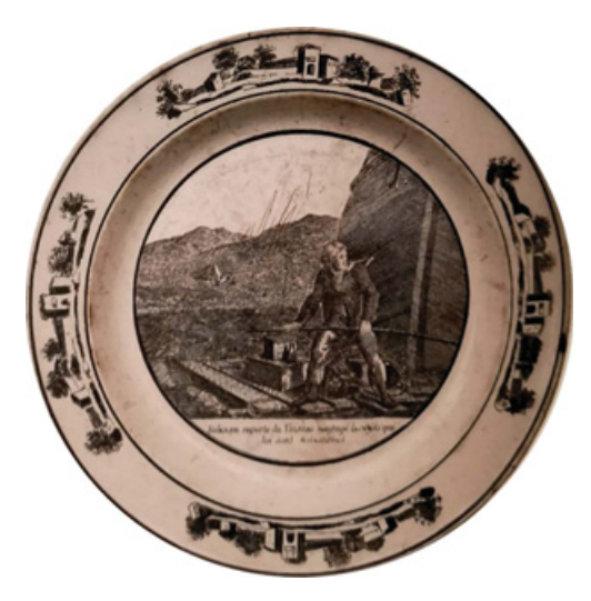
Figure 24 Transfer print on Montereau plate '[Robinson on the raft]', c. 1825 (diameter: 21.7 cm). Collection Sandro Jung.

explanatory caption. As a result, it does not direct the reading of the subject depicted, including the relevance of the tent in the background as Crusoe's temporary shelter, as it is denominated by the caption and cartouche text of Panckoucke's edition and the Montereau plate respectively. It is likely that the artisan responsible for the selection of cartouche titles for the Montereau series derived titles from the reprinted illustration in Verdière's cheaper 1821 edition, rather than from Panckoucke's. For Verdière, in addition to omitting Stothard's name from the plate, also opted for simpler captions than those ones adopted by Panckoucke. Verdière chose 'Robinson emportant diverses choses du vaisseau' to characterize the design, a simpler version closely echoed by the Montereau plate text. Stothard's original design, moreover, had introduced a detailed background featuring trees, a large rock formation and Crusoe's tent. Blewett characterized the scene as 'an idyllic landscape' (Blewett, 1995, p. 58) that had contributed to idealizing Crusoe. In the design for the Montereau plate, no such idealization is offered because these features are omitted altogether. Instead, the background boasts a barren, mountainous landscape to underscore the necessity on Crusoe's part to secure as many resources from the ship as possible to establish a more permanent habitation than the tent that will provide him with a safe refuge.