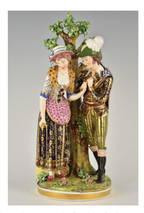
Figure 21 Painted Royal Crown Derby figurine of Palemon and Lavinia (height: 33 cm), 1820.

its presentation of dress not only appropriated existing fashions but in turn may have inspired particular fashionings of Lavinia in real life.