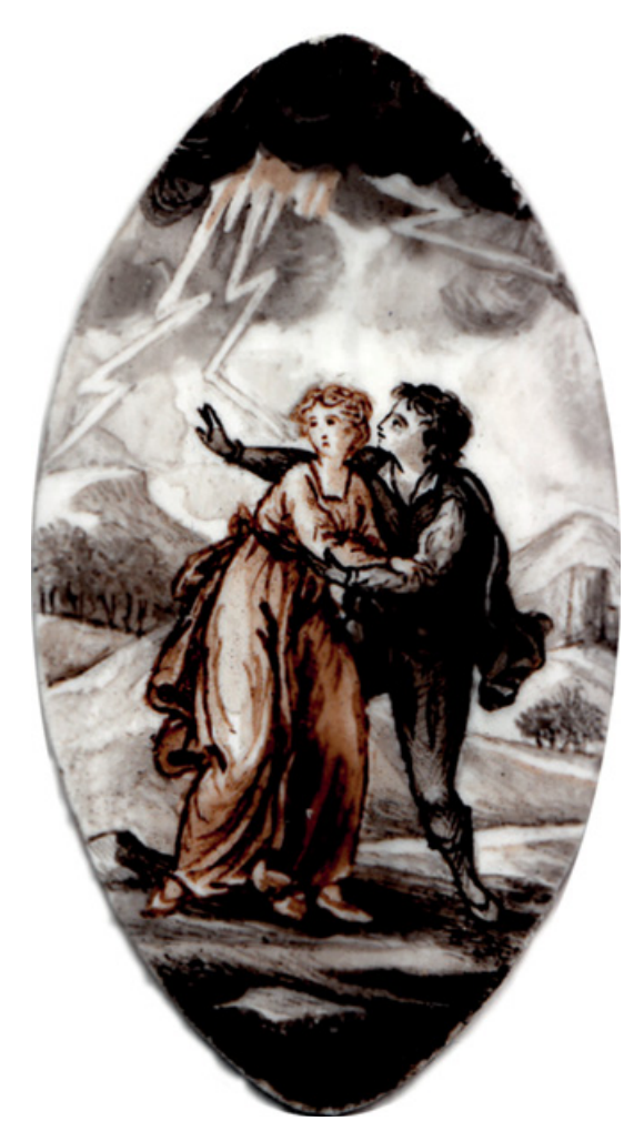
Figure 4 Love token, with enamel painting of Celadon and Amelia on ivory (2 \times 4 \text{ cm}) , c. 1790. Collection Sandro Jung.

novels, induced booksellers to issue chapbook epitomes that highlighted parts of particular interest, including the protagonists' adventures, trials and dangers. These textually embedded vignettes offered micro-stories that showcased characters involved in actions and meaningful settings at the same time that they conveyed particular sentiments and ideologies. They served as metonymic placeholders for entire works, encompassing moments that helped readers to make sense of the characters' role within a larger narrative; they also piqued 'interest', inducing readers to (re)familiarize themselves with the work from which the vignettes had been singled out through illustration. James Beattie held that vignettes 'animate' literary works, for 'human actions are the columns and rafters [of 'the poetical