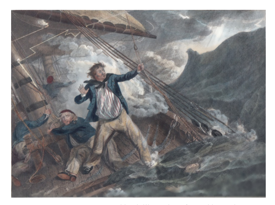
Figure 1 Copper-engraved book illustration of '[A Shipwreck]' (15.8 × 21.4 cm), designed by Charles Catton and engraved by Francis Chesham, The Seasons (Perth: R. Morison, 1793). Collection Sandro Jung.

volume signified differently (Figure 2). The original sailor standing and holding on to a rope, who in Thomson's poem was nameless, is now transformed into the title protagonist, Defoe's text being used to gloss that which is depicted by the image.