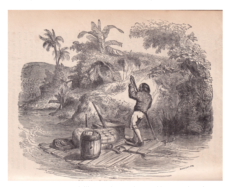
Figure 29 J. J. Grandville, Wood-engraving '[Robinson on the raft]' (13.3 × 11 cm), Aventures de Robinson Crusoe (Paris: Fournier, 1840). Collection Sandro Jung.