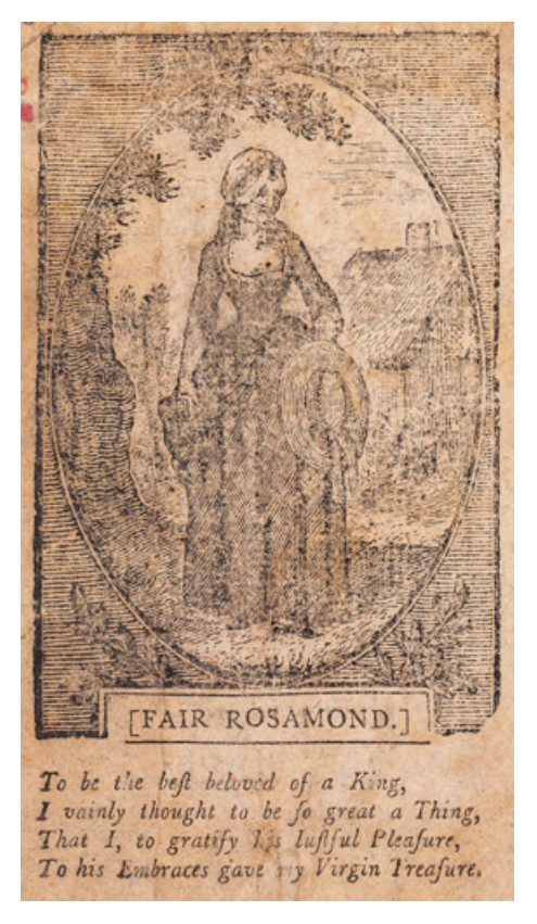
Figure 10 Wood-engraving of redacted version of frontispiece to The History of Pamela (New York, 1796), The History of Fair Rosamond . . . and Jane Shore (New York: J. Tiebout, 1796).

needed to be set (Figure 10).<sup>6</sup> Reading the addition of Pamela's name to the frontispiece as a confirmation of the character's recognized status as 'a renowned and heroic figure despite the fact that she was entirely fictional' (Walsh, 2017, p. 154), Megan Walsh assigns text-related specificity and particularity to the image, seeing it as one uniquely attuned to and illustrative of Pamela only. Walsh's taking for granted that the image is not derivative and can function only in the specific context of Tiebout's abridgement runs counter to the printer's illustration practice and his transmediating the same illustration for use in his edition of The History of the Fair Rosamond .