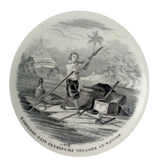
Figure 30 Transfer print on Creil-Montereau plate '[Robinson on the raft]', c. 1850 (diameter: 22 cm). Collection Sandro Jung.