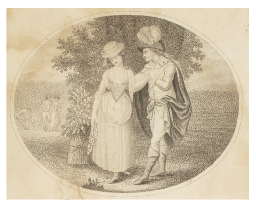
Figure 19 Copper-engraved cover vignette, Hymen's Recruiting-Serjeant (Philadelphia: M. L. Weems, 1800).

Similar to the replacement of the architectural feat represented on the second jug, the revision of Lawrenson's design for use as the copper-engraved frontispiece of Weems's Hymen's Recruiting-Serjeant concerned Holland House (Figure 19). In the case of the American publication, the mansion was removed altogether and the space that it had previously occupied was transformed into a field. To the readers of Weems' pamphlet, which focused on the subject of