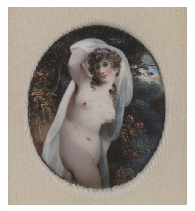
Figure 15 Enamel miniature on copper, depicting Musidora (4.7 × 4.0 cm), executed by William Russell Birch, c. 1810.

was not the first or only one that depicted Musidora, however, for a Musidora miniature by Thomas Day (who had already produced a Musidora in crayons for the Royal Academy exhibition of 1777) had been on display at the annual exhibition of the Royal Academy in London in 1783 (1783 Catalogue, p. 4). <sup>19</sup> In a marked alteration by transmediation, an understanding of the nude female body as inherently sexualized and indecorous, and of Damon's illicit act of observing Musidora as improper, was countered in America by an expansion of the Musidora story that concluded with the union of Damon and Musidora: they marry. <sup>20</sup> This marriage, as in René Louis de Girardin's rewriting of Thomson's tale in his story of Musidora and Hylas, <sup>21</sup> both served as an antidote to and neutralized