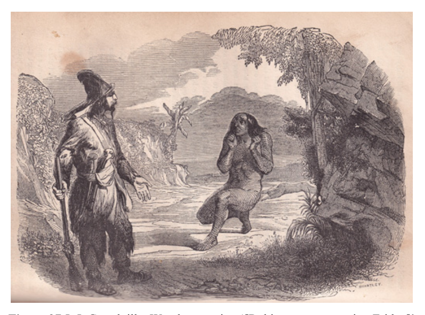
Figure 27 J. J. Grandville, Wood-engraving '[Robinson encountering Friday]' (14.8 × 10.6 cm), Aventures de Robinson Crusoe (Paris: Fournier, 1840). Collection Sandro Jung.