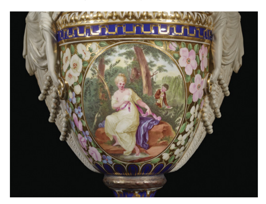
Figure 12 Enamel painting of an adapted design of Kauffman's design of 'Damon and Musidora', Derby Porcelain Vase (height: 40.64 cm). British Museum number: 1923,1218.13CR.

form, with handles of winged harpies' (Ferguson, 2018, p. 26), Kauffman's scene conveys its story through a neoclassical medium to illustrate a classic modern subject. The three components of the garniture entailed the framing of the large vase by the ewers and in the process relate Thomson's work to Shakespeare's canonical productions. In this respect, the garniture promoted the monumentalization of Thomson through an elite ceramic medium, his poem - represented through Kauffman's rendering of the Musidora story being physically flanked by visualizations of Shakespeare's works. This multi-piece garniture not only entailed a particular spatial arrangement of the individual porcelain objects to create a pyramidic scene but also, by means of the caryatid handles of the central vase – through the association of caryatids (or korai [maidens]) with the maidens who carried sacred goods used at feasts of the gods - imbued it with a proto-sacral function. The symbolism of the caryatid handles shapes the material meaning of the object as a vessel – akin to a Greek illustrated vase – to tell a mythological or sacred story. The three strands of pearls underneath each of the handles furthermore support the symbolism of purity, innocence and virginity that the image and text infer separately but also interconnectedly. At the same time, the set of vase and ewers were display objects that functioned