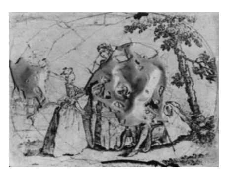
Figure 6 Redacted version of H.-F. Gravelot's '[Pamela meeting Miss Godwin, Mr B. looking on]' painted onto an enamel snuff box.

framed by a tree on the right. Applied to the inside base of the snuff box, Gravelot's illustration was meant for private viewing, allowing the beholder access to a staged scene that no longer forms part of the sequence of plates that