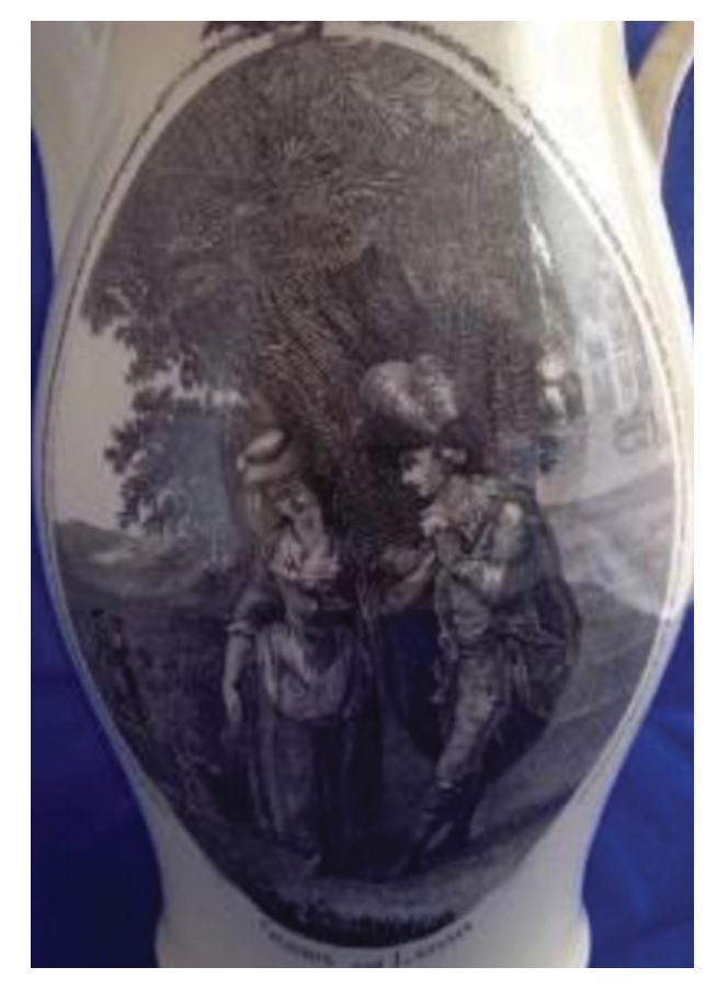
Figure 17 Transfer-printed jug featuring Palemon and Lavinia (height: 16 cm). Collection Sandro Jung.

putting his arm around the woman and the group of harvesters mirroring in the background the scene that is enacted by Palemon and Lavinia. The design on the pitcher emphasizes their commonality rather than their social difference, bringing them together in a way that Thomson's tale did not. As such, it illustrates the possibility of romantic love for all classes.