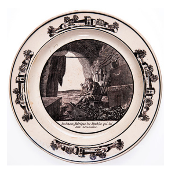
Figure 26 Transfer print on Montereau plate '[Robinson in the cave]', c. 1825 (diameter: 21.9 cm). Collection Sandro Jung.

shape of the image on the plate, which, in turn, is prescribed by the shape of the well. Framed by thick black lines, Stothard's altered scenes are intimate glimpses into the storyworld of Robinson Crusoe . Similar to a telescopic view, they focus and enlarge the subject captured, but the new versions of Stothard designs also reduce detail that would have provided further cues for the imaginative expansion of scenes only evoked rather than fully represented.