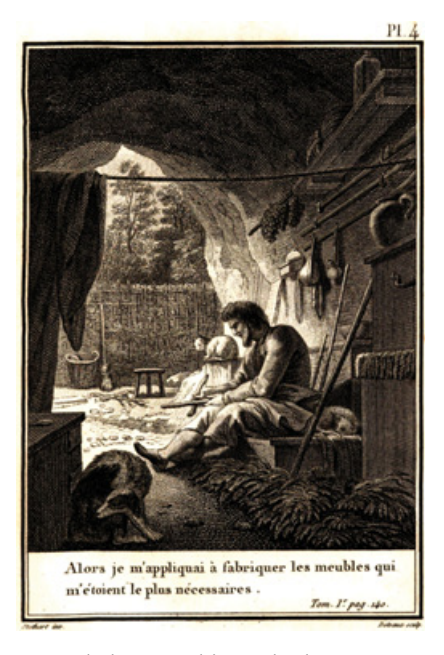
Figure 25 Copper engraved plate '[Robinson in the cave]', La Vie et les Avantures de Robinson Crusoe (Paris: La Veuve Panckoucke, 1800). Collection Sandro Jung.

capturing the production of furniture emphasizes the effort it took Crusoe to turn carpenter, but it also notes that he manufactured only those pieces of furniture that he required most: 'Alors je m'appliquai à fabriquer les meubles qui m'étoient le plus nécessaires'. Again changing narrative perspective, the cartouche on the Montereau plate adopts the third-person, matter-of-fact statement that 'Robinson fabrique les Meubles qui lui sont nécessaires', the same as the caption in the Verdière edition, to concentrate merely on the action (Figures 25 and 26). Both the caption and the cartouche text, importantly, did not refer to the setting of this production activity, whereas it is centralized in the title provided in Stockdale's edition, 'Robinson Crusoe at work in his Cave'. To Stockdale, the interior of Crusoe's habitation represented a home that the protagonist had created through his own ingenuity. It introduced to readerviewers the hero's family, the cats and dog, as well as an inventory of his tools. The version of Stothard's image included in illustrated editions differed in one important respect from the illustration realized on the well of the Montereau plate: it offered a view out of the cave on to Crusoe's fence, a large basket, a stool and an axe that are used as part of various activities to improve his habitation. Eliminating these iconic details from the design creates a scene without a background, the circular mouth of the cave replicating the circular