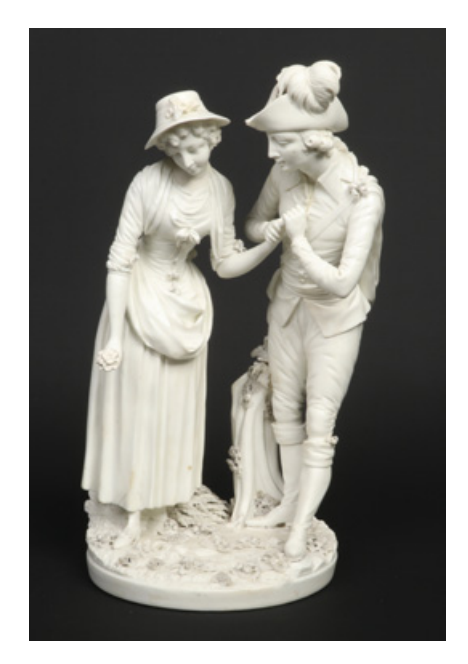
Figure 20 Derby biscuit figurine of Palemon and Lavinia (height: 27.5 cm), c. 1790. Collection Sandro Jung.

transformation is thus her voiceless acquiescence to Palemon's courtship, an agency that removes her from the active sphere of gleaning to the silent language of looks and blushes. In contrast to the print and the design on the pitcher, the expensive materiality of the Derby object obscures the young woman's sudden elevation and removal from poverty. The gilding on cobalt-blue, which is used for Lavinia's dress and Palemon's waistcoat, as well as the gilt stripes on the latter's pantaloons, reveal these figurines to be luxury objects for display: utilizing colours ranging from blue to pink, they underscore the characters' symbolic nobility.<sup>33</sup> The range of detail in the figures themselves (the floral painting on Lavinia's upper garment, the ribbons and bow, as well as the finely executed foliage) and colour palette applied speak to the exceptional material quality of this transmedial iteration of Lawrenson's two-dimensional design. The details of Lavinia's clothing instance the kind of fashionable dress that may have been worn by women who were either impersonating the character on a particular occasion or painted, as was Frances Talbot, 'in the character of Lavinia' (1802 Catalogue, p. 14).<sup>34</sup> Migrating across media from print to ceramics, Lawrenson's design in