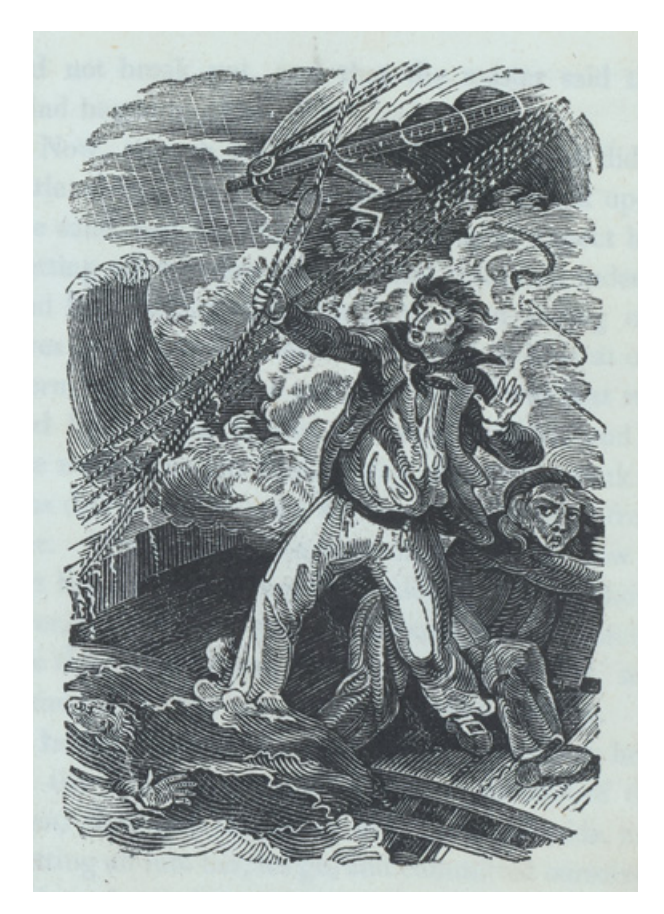
Figure 2 Redacted wood-engraved version of Catton's illustration (5.5 × 8.3 cm), The Life and Adventures of Robinson Crusoe (Edinburgh: Ballantyne, 1810).

through the lightning (Figure 3). The love token, by contrast, highlights the deep emotional connection between Celadon and Amelia (Figure 4). This gift for a lover introduces the danger of the thunderstorm, centralizing the lovers as a unit that is stable and will not be destroyed by the lightning. The transmedial uses of Kauffman's (and Catton's) illustrations demonstrate changes in meaning, including the modal and tonal revision and re-inscription of the designs that are effected by both context and medium.