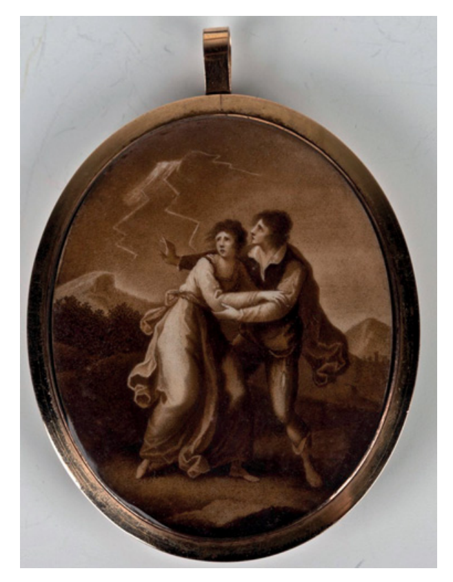
Figure 3 Mourning pendant, with sepia painting of Celadon and Amelia (7 \times 4 \text{ cm}) , c. 1790. Collection Sandro Jung.

studies examine the use across different media of illustrations (comprehending the designs for both book illustrations and furniture prints for framing) of three eighteenth-century works: Daniel Defoe's The Life and Strange Surprizing Adventures of Robinson Crusoe (1719), James Thomson's The Seasons (1730) and Samuel Richardson's Pamela: or, Virtue Rewarded (1740). These case studies will reveal that material culture incorporating illustrations forms part of 'a culture based on the visual, on modalities of visualization, the production and consumption of visual matter' (de Bolla, 2004, p. 4), which conceived of literature as much as a textual as a visualizable, potentially ekphrastic phenomenon.