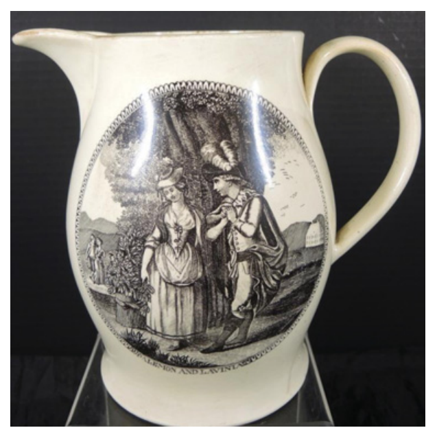
Figure 18 Transfer-printed jug featuring Palemon and Lavinia (height: 16.2 cm). Collection Sandro Jung.

In addition to the design on the jug discussed, another version of Lawrenson's design was used for transfer-printing on jugs and mugs (Drakard, 1992, p. 64). The latter adaptation retains the two reapers in the background, except that they are looking at one another rather than towards Palemon and Lavinia (Figure 18). The ears of corn that Lavinia carries are barely distinguishable from the foliage of the tree, which effectively lessens the association between her and the act of gleaning. Her face is rendered more delicately, the reduced tonality of the print putting into sharper relief the figure design. The most radical change introduced in this version of Lawrenson's design is the replacement of Holland House: now, we see a non-identifiable mansion much further in the background than Palemon's home had been in the print and the transmediated version of the jug discussed earlier. The physical distance between the mansion and Palemon also