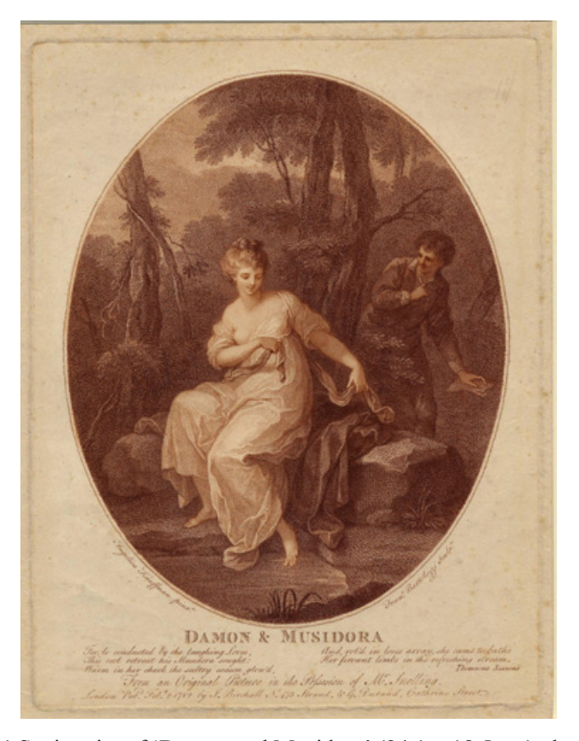
Figure 11 Sepia print of 'Damon and Musidora' (24.1 × 18.5 cm), designed by Angelica Kauffman, engraved by Francesco Bartolozzi (London: James Birchall, 1782).

Kauffman's design embellishes the central vase of a three-piece Derby garniture, the other pieces being ewers decorated with Shakespearean scenes (Figures 11 and 12).<sup>12</sup> Featuring on the 'therm vase', 'a hybrid Antique