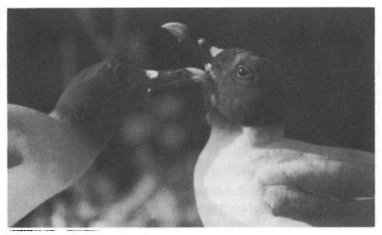
Swallow-tailed gulls show mutual preening behaviour alongside tourist trails (R.W. Tindle).

Herds of sea-lions Zalophus californicus and marine iguanas Amblyrhynchus cristatus continue their disregard for the nearest visitor, though guides wisely outlaw touching the animals. Feed-