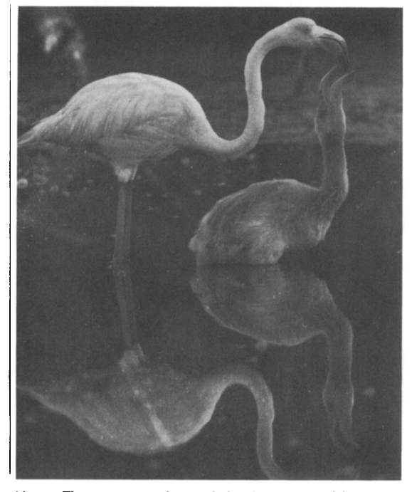
Above: Flamingo juveniles are fed within metres of the tourist trail (R.W. Tindle).

Below: Male marine iguanas exhibit ritualised combat at the visited Punta Espinosa colony (R.W. Tindle).