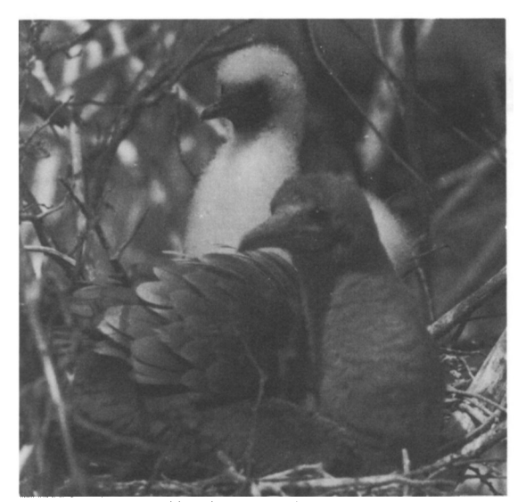
In 1981 red-footed boobies nested more densely on Genovesa Island than at any time since tourism began.

hurry so readily to the 'other-side' of the lagoon (indeed they have nested twice in the last five years at the heavily visited Punta Cormorante, a lagoon where breeding has occurred only very sporadically in the last 50 years, and was latterly recorded in 1964). The yellow warbler Dendroica petechia, previously timid, now flutters around one's shoes. For the last couple of years, a nesting pair of great blue herons Ardea herodias has overlooked launch-loads of snorkelling tourists at Devil's Crown.