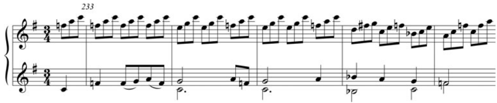
Example 10. Haydn, Capriccio in G major, HXVII:1, bars 233–237, from Œuvres complètes , volume 2 (Leipzig: Breitkopf und Härtel, 1800)