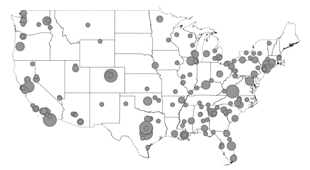
Fig. 1. Location of mass public shootings in the continental United States, 1966–2015 Note: the size of the circle marker corresponds to the number of injured and killed. The map was created in TileMill<sup>®</sup>, with state lines drawn from 2014 cartographic boundary shapefiles from the US Census Bureau (https://www.census.gov/geo/maps-data/data/cbf/cbf_state.html).

(for example, school, shopping mall, movie theater, church, etc.) targeting seemingly random members of the public. Using these restrictions, we were left with a database containing N = 210 mass public shooting events between 1966 to 2015; 50 per cent of these events occurred after 2007, and 75 per cent of these cases occurred after 1994. Therefore we see that mass shootings have been increasing over time, particularly over the past 15 to 20 years.<sup>60</sup> The average number killed in these events was 4.5 people (min = 0, max = 33 [Virginia Tech Shooting]), and the average number injured (excluding those killed) was 5 (min = 0, max = 58 [Movie Theater Shooting in Aurora, CO]). Figure 1 presents a map of this data, which marks each event's location and varies the size of the markers according to the number of persons injured or killed.