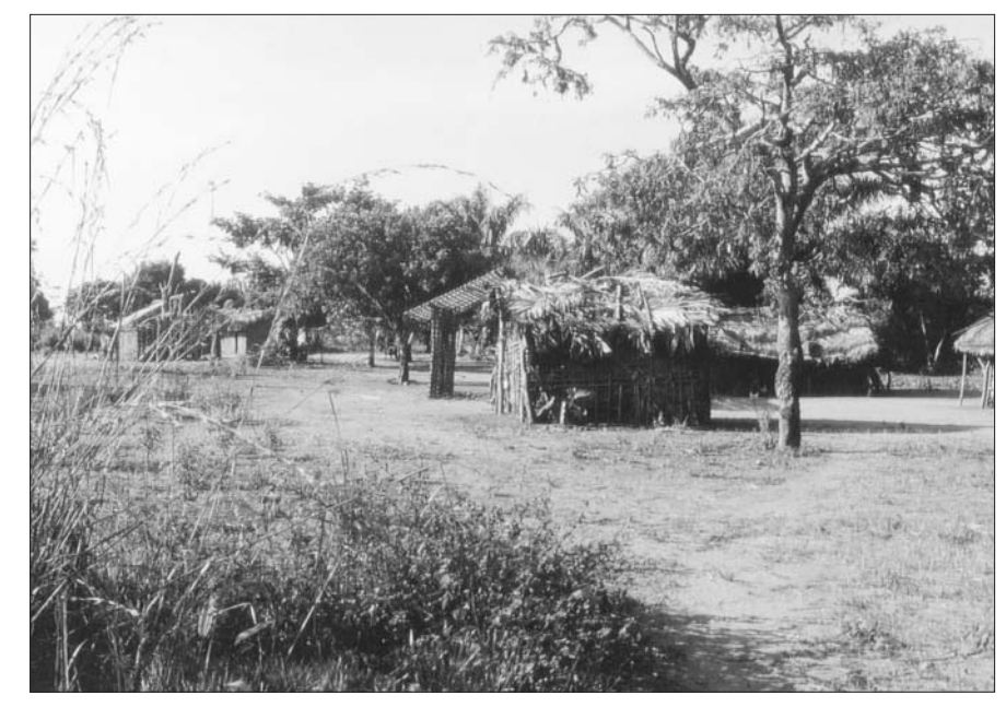
Reality in Angola

I initiate the appropriate therapy here (quinine, amp and chloramphenicol intravenously), and perform a gross neurological examination before an LP that yields frank pus. Off with the anti-malarial, and on with the prayers to ward off the Kindoki.