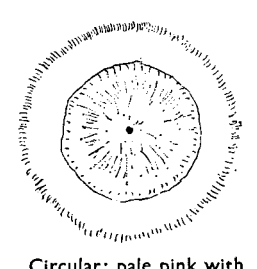
Circular; pale pink with pronounced 'halo'