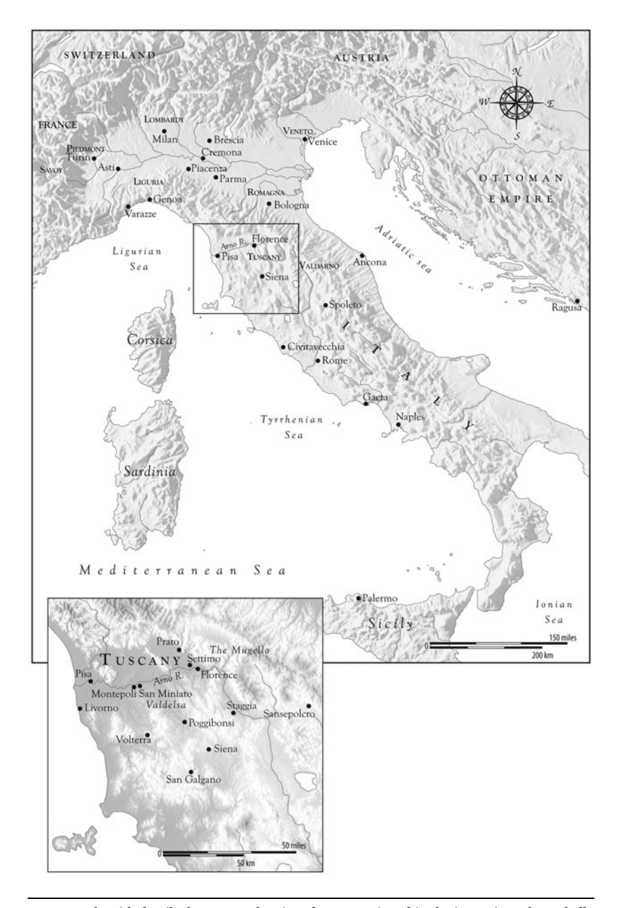
Map 2. Italy with detail of Tuscany, showing places mentioned in the issue. (Map by Isabelle Lewis.)