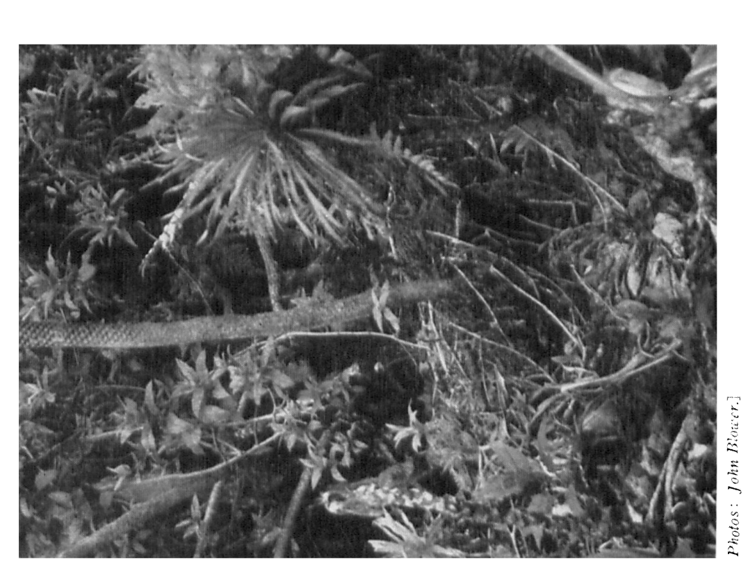
A GORILLA BED AMONG GIANT LOBELIAS IN THE SUB-ALPINE ZONE.