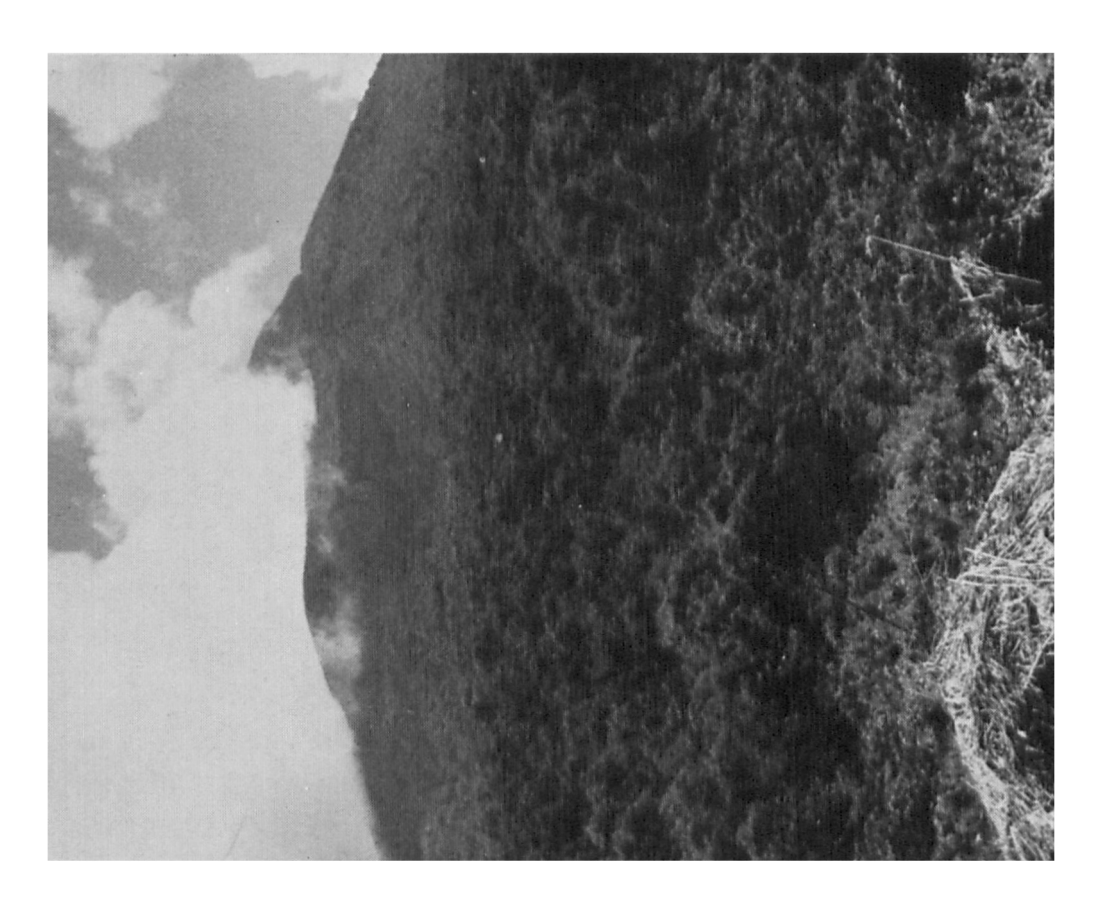
MT. MUHAVURA. SHOWING TYPICAL GORILLA HABITAT IN THE HYPERICUM ZONE.