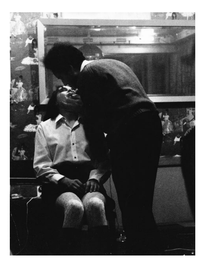
Figure 1. Giuseppe Chiari, Don't trade here, 1968, Berlin (Collection Gianni and Giuseppe Garrera).

it consists of Chiari repeating the word 'mamma' with a different rhythm and tone of voice and using an amplification system, probably because of the huge cavernous space, certainly an unusual venue for such a celebrated event and definitely unsuitable for staging singing performances, especially if you're looking to create an intimate atmosphere. Of particular interest, in this case, is the fact that Chiari used his voice to utter the sounds of a typically childish word, in that fuzzy area between adult speech and baby language, featuring some analogies with the condition of inferiority staged by Ketty La Rocca in Verbigerazione , which we will talk about shortly.