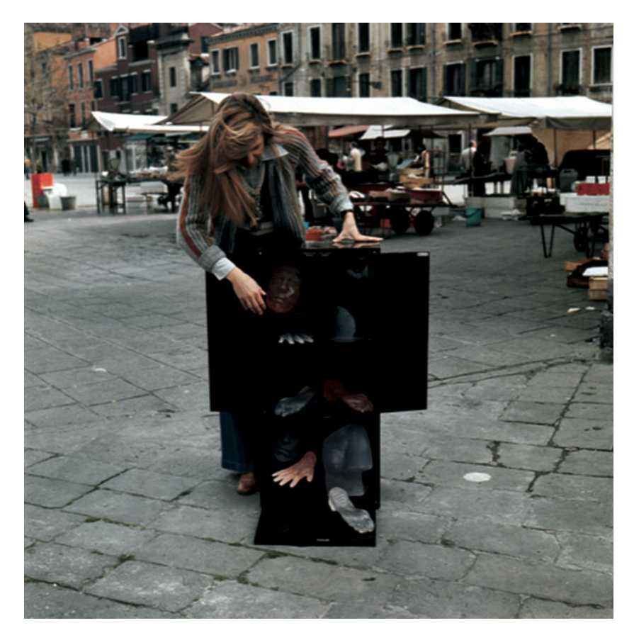
Figure 3. Federica Marangoni, Ricomposizione e vendita della memoria , 1975.

also producing videotapes: regarding this later production, however, while the references to the artist's body remain, there is no longer any quest for intimacy, but rather the staging of a self-produced violence with fire that melts the wax casts of the artist's body (1979, at the Sala Polivalente, Ferrara) or with nails, hammer and scissors that destroy or nail to the floor the metal, glass or paper butterflies of Il volo impossibile (The Impossible Flight) . In the latter cases Marangoni performs strong, vindictive or self-punishing gestures on her work, which has the shape either of the artist's body or of the insect popularly identified with the female sex. Therefore, it is only in Ricomposizione e vendita della memoria that Marangoni seeks to establish a close rapport with the public of passers-by and ordinary people, rather than with contemporary art enthusiasts, while later on the gestural and material symbolism she displays can only push the observers away, keeping them at a distance – like at the theatre – rather than close to the artist, or simply watching a recording, as in the case of the videotape of her performance of The Box of Life (1979).