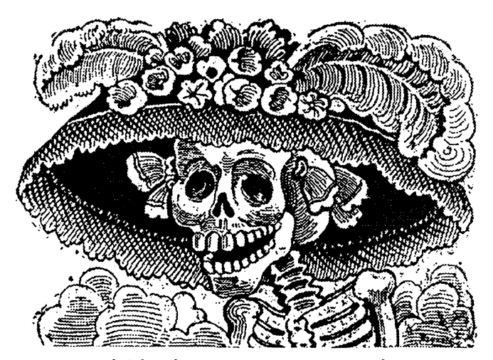
University of Nebraska Press · 901 N 17 · Lincoln 68588·0520