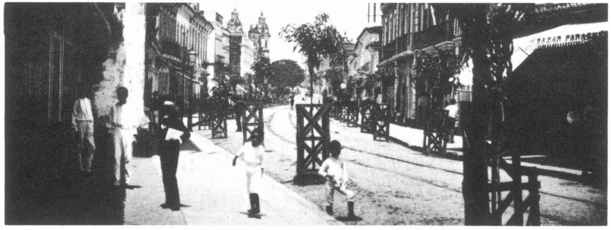
Photography in Brazil