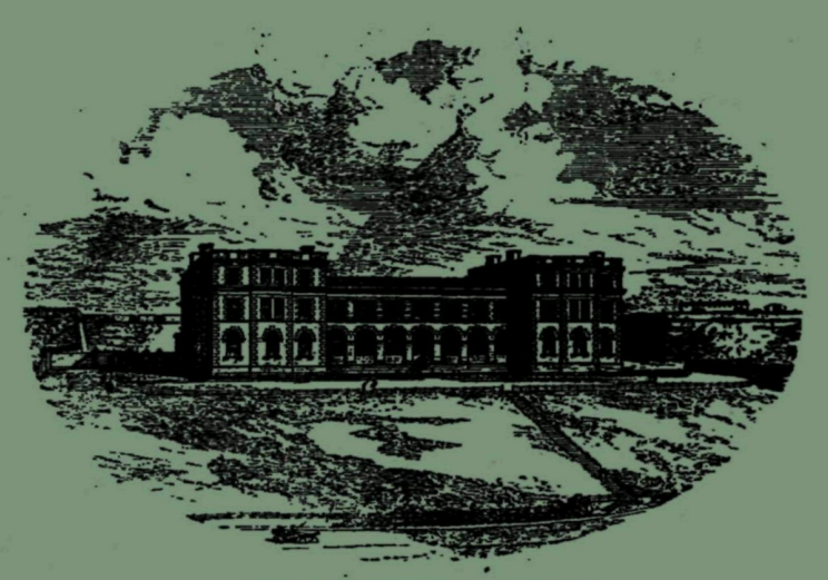
THE PLYMOUTH LABORATORY.