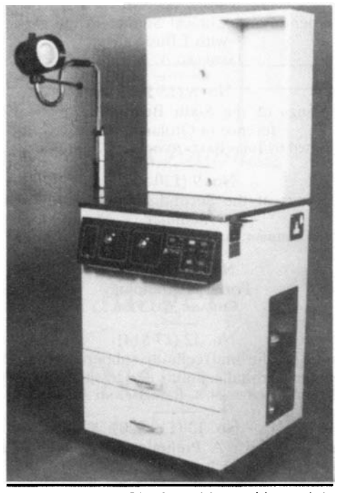
Single cabinet with module.

ALTOMED LTD, PARK HOUSE, PARK ROAD, GATESHEAD, TYNE & WEAR, ENGLAND. TEL: (091) 478 1001 TELEX: 537941 ALTMED G