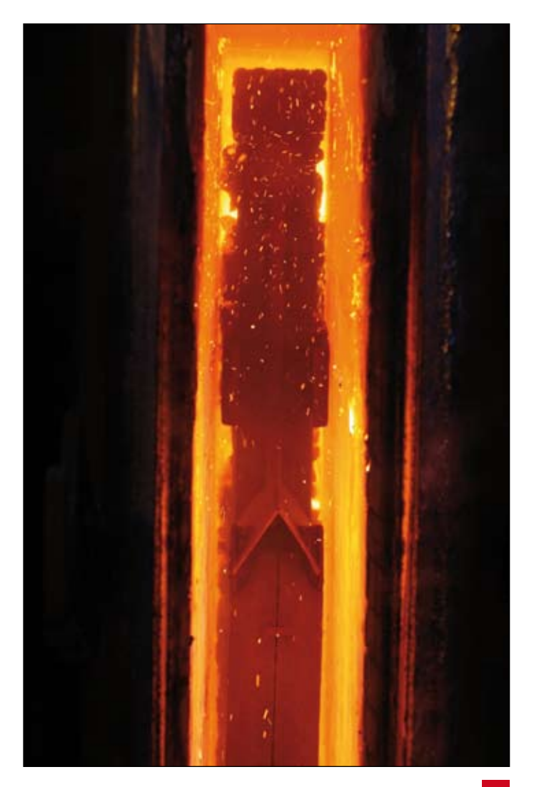
A camera-based system that allows monitoring of the coke pushing phase.

The unit is mounted on the coke guide from where it performs visual oven condition monitoring with video cameras during the cokepushing sequence. Continuous coke-temperature measurements are also performed to monitor wall heating and heat transfer to coke, in addition to other applications. High-capacity and fast wireless data transfer to a LAN server allows operators to systematically evaluate coke oven conditions. Selected photos are stored in the data base for reference as well as to improve evaluation and interpretation skills.