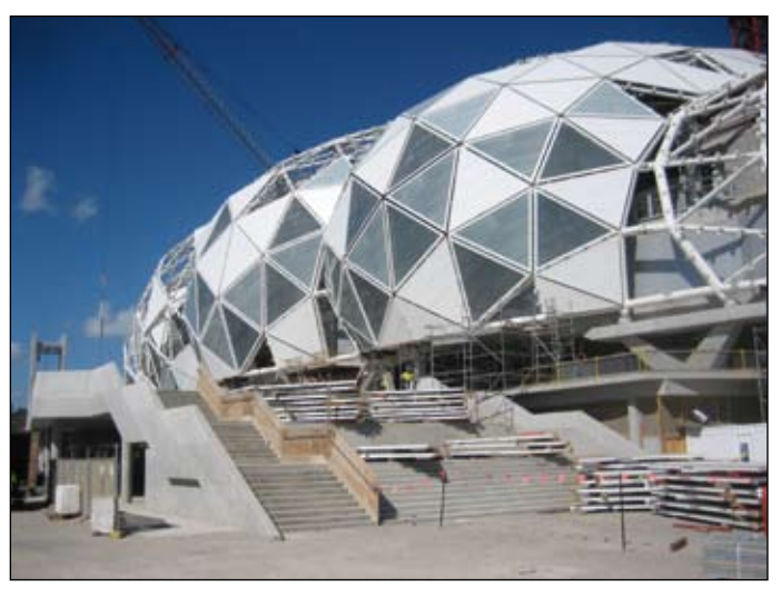
The new stadium was inaugurated on May 7, when the Australian rugby league team met the New Zealand national side.

The robot system is operated and monitored from a central control room. Siemens was responsible for integrating the LiquiRob System into the existing Dog house and the EAF automation system, as well as for commissioning, and training the operating personnel. The solution implemented in Neuves-Maisons also includes installation of three automated magazines to store the sample and measuring probes, which can be safely filled by the operating personnel one time per day outside the dog house. The sampling and measuring procedures can be run auto-