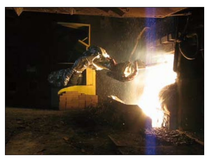
The Siemens LiquiRob robot system in action at the electric arc furnace of SAM Neuves-Maisons, Riva, France.