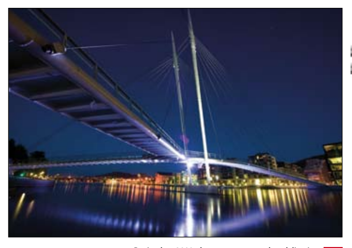
During late 2009, the company agreed on deliveries for some 15 bridges in different countries.

The foundation piles will be made at Ruukki's Oulainen unit in Finland and deliveries will begin in April. Fabrication of the load-bearing steel structures will begin in summer 2010 at the Ylivieska unit and installation will start in autumn 2010. The new Pekkala bridge will open to traffic in 2012.