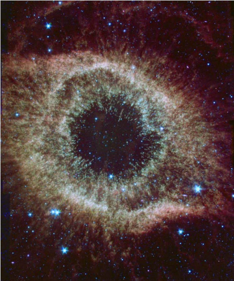
Figure 2. IRAC image of the Helix, with the 3.6, 4.5, 5.8, and 8.0 \mu\text{m} bands are mapped to blue, green, orange, and red, respectively. The image is approximately 24 \times 26 arcmin in size. The cometary knots are visible inside the main ring; the knot tips are relatively brighter in the 3.6 and 4.5 \mu\text{m} bands, and the tails are brighter at 8 \mu\text{m} . The nebular emission is dominated by \text{H}_2 in the IRAC bands.

bandpass, possibly due to atomic lines such as \text{Br}\alpha , [\text{Mg IV}] and [\text{Ar VI}] in that band. The edge of the ring and the outer halo are orange-red, consistent with emission from \text{H}_2 in the 5.8 and 8 \mu\text{m} bands.