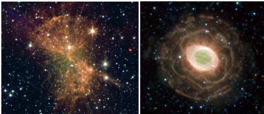
Figure 3. IRAC color images of PNe. The 3.6, 4.5, 5.8, and 8.0 \mu\text{m} bands are blue, green, orange, and red, respectively. Left: the Dumbbell (NGC 6853). Right: the Ring (NGC 6720).

position of the central star. This dust is likely responsible for the previously observed deep fadings of the central star. The 70 \mu\text{m} image shows a double-peaked morphology in the narrow waistband of the nebula, indicating a possible dust torus structure. The 160 \mu\text{m} image shows that the nebula is contained in an extended cold dust envelope.