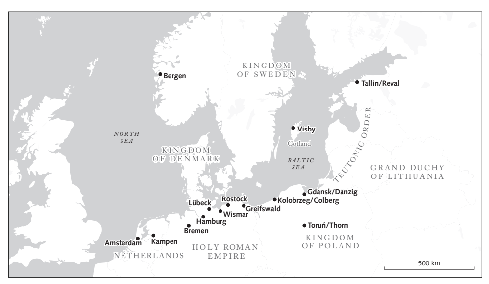
Figure 3. The North Atlantic and The Baltic