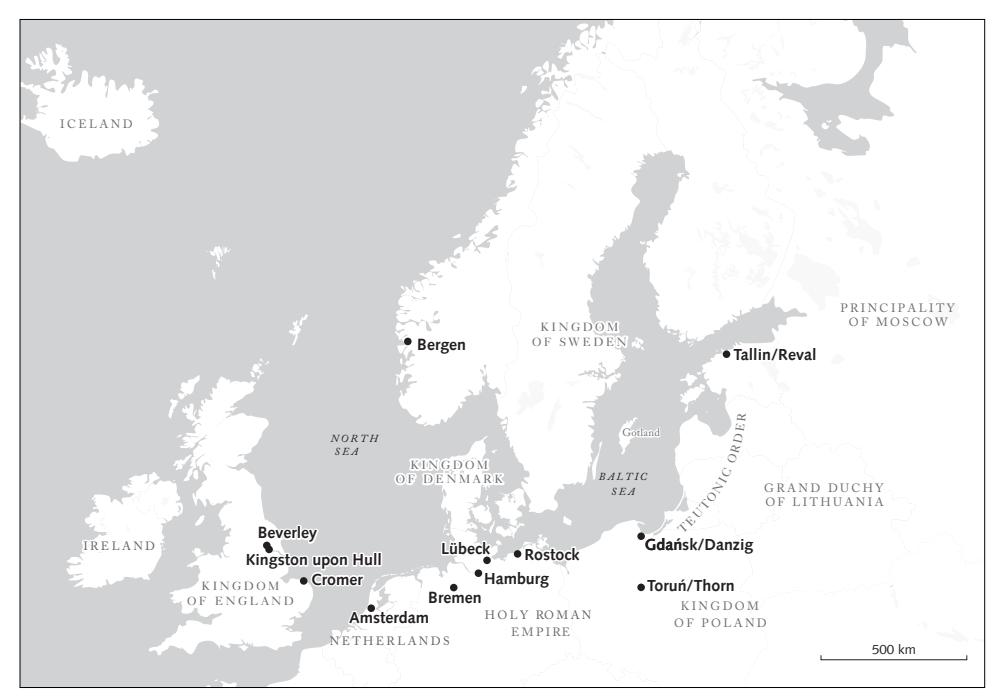
Figure 2. The fifteenth-century Baltic