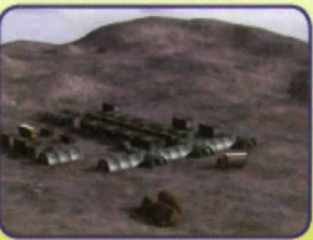
Norlense inflatable tents