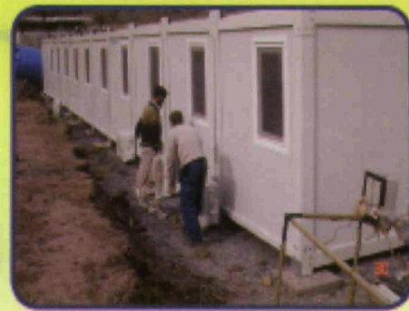
MSF Hospital, Hattian Bala, Pakistan