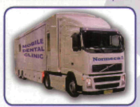
All kinds of clinics or hospitals in MultiSpace