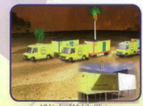
All kinds of Mobile Clinics