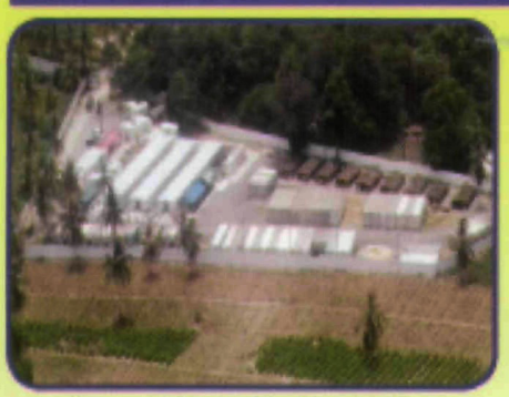
Thai Tsunami Victim Identification Centre