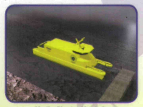
NorCat Floating Hospitals