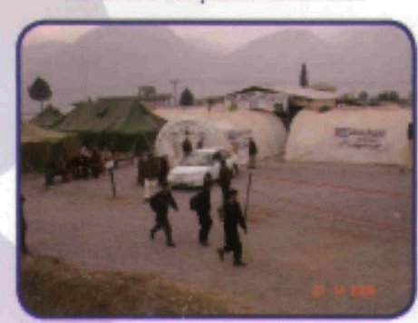
Cuban Hospital, Muzaffarabad, Pakistan