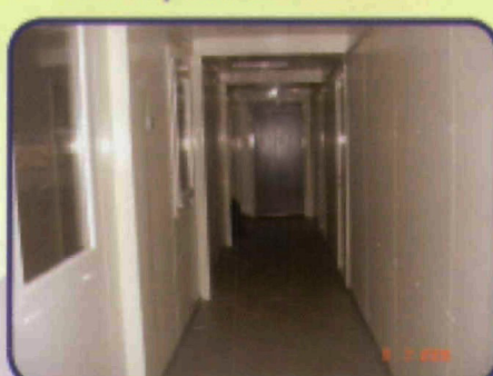
Inside MSF Hospital in Hattian Bala

Number One in the world within partly and turn key solutions incl. Transportation, Erection, Management, Training, Maintenance, Education, Administration,