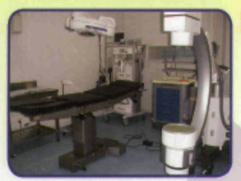
Inside OT in KATIKO Referral Hospital