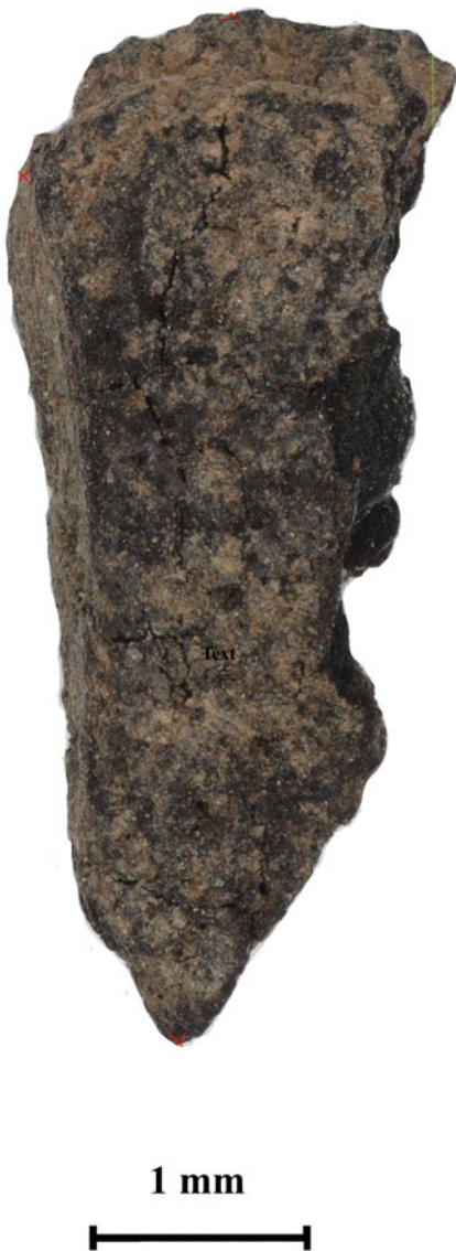
Figure 3. Early Middle Woodland domesticated sunflower kernel. (Color online)