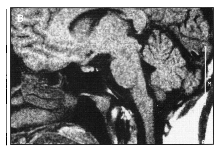
Figure 1 — NMR picture showing the exclusively suprasellar localization of a GH-secreting adenoma in a pediatric patient (see text). A = before \ surgery. B = after \ surgery.