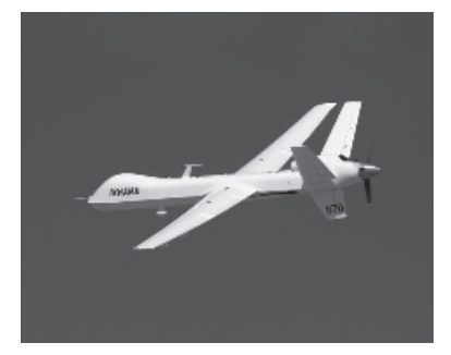
(a) Unmanned Aircraft