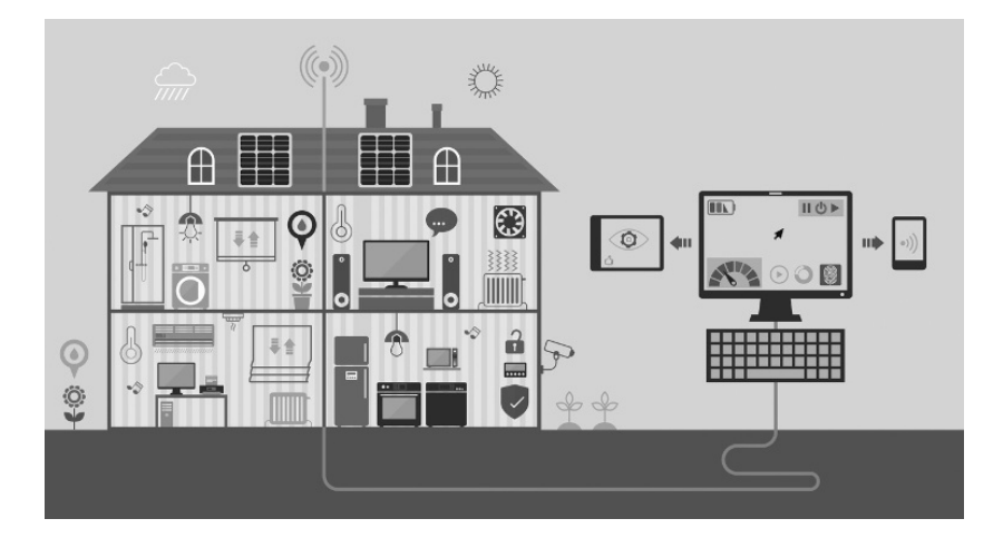
Figure 1.1 'Smart' home

essentially adaptive, the role of the human driver in terms of high-level decisions is increasingly being carried out by software on the vehicle that can make decisions about which route to take and could even foreseeably choose destinations such as petrol stations, supermarkets, and restaurants. While, at the time of writing, there are a number of technological and regulatory obstacles in the way of fully autonomous vehicles, automotive manufacturers are quickly moving towards convoying or 'road train' technology. However, as described earlier, there are clearly some legal/regulatory and ethical questions surrounding even this limited form of autonomous behaviour, especially when the system must decide whether to allow control to be given back to the driver or not.