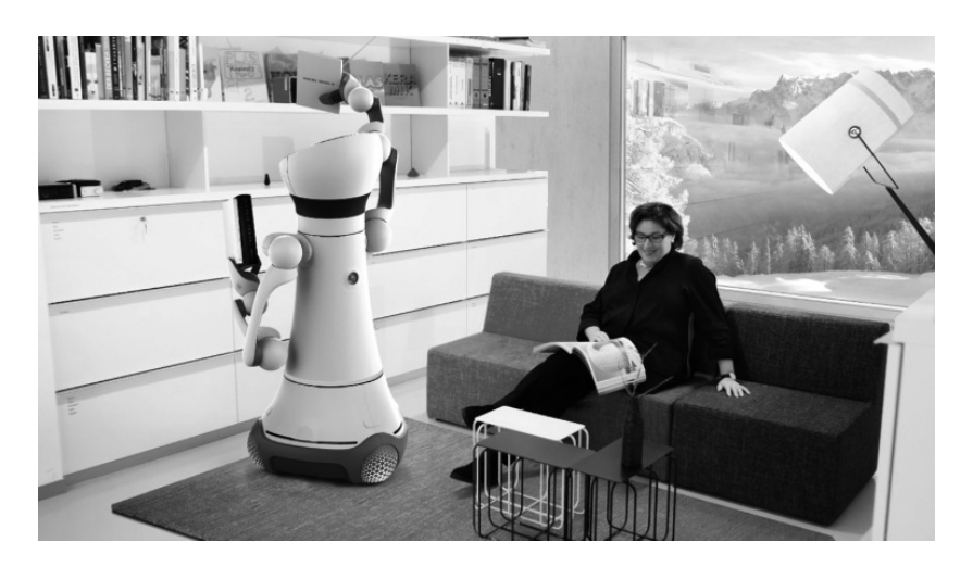
Figure 1.3 Care-o-Bot 4 robotic home assistant

more flexible, autonomous robotic assistants not only in the workplace but in our homes. Robotic cleaning devices, such as the Roomba, <sup>1</sup> already exist but it is much more autonomous Robotic Assistants that are now being designed and developed. Initially intended for the elderly or incapacitated, we can expect to see such robots as domestic assistants in our homes quite soon (see Figure 1.3).