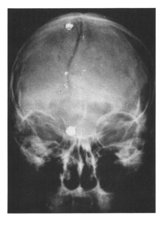
Figure 3 — Illustrates the numerous retained fragments which are commonly seen following low velocity, small caliber gunshot wounds.

At the Tennessee Health Sciences Center, 76 civilian gunshot wounds were treated in the 20 month period ending in 1985. 16 Overall there was a 62% mortality rate. Patients with a GCS of 3 invariably died, with or without surgery and the