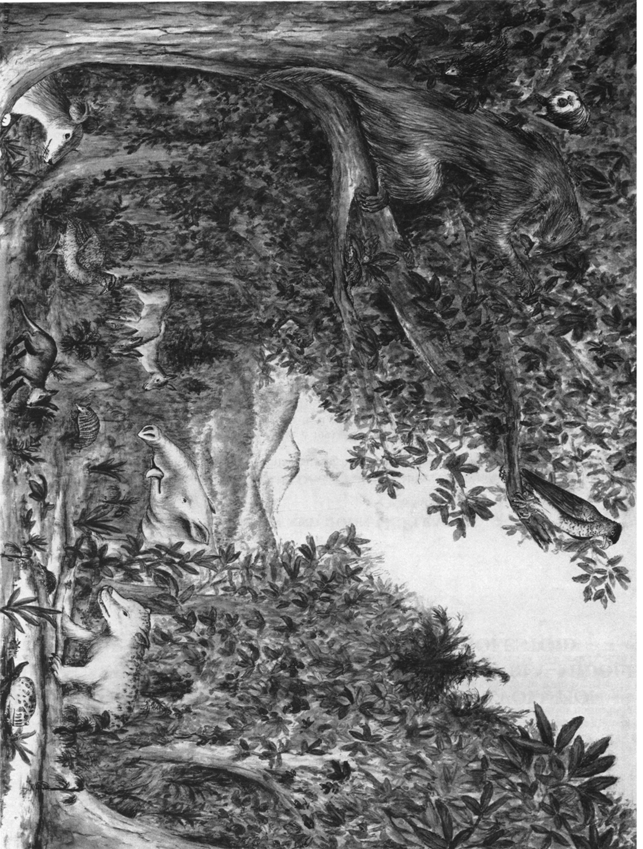
FRONTISPICE—Reconstruction of Santacrucian mammal fauna in the valley of the Río Pinturas, by Luci Betti.