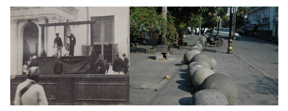
Figure 4. Fatahillah Square as a (post)colonial space Public execution as held in the colonial past (Left); Stones used to bind prisoners, now used to prohibit vehicle entry (Right)

building collapsed in an earthquake. The façade of the new building remains to this day. It continued to be used as a church and then as a warehouse for a trading company. In 1939, when the Dutch colonial period was almost over, it was used to exhibit the history of the city of Batavia. After independence, the building opened as the Wayang Museum in 1975.