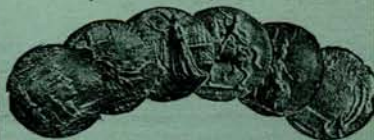
Gold Medal (Highest Award), Allahabad 1910.

GRANDS PRIX: Paris 1900, Brussels 1910, Buenos Aires 1910.