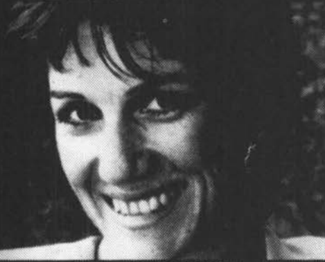
HARRIET WALTER THE DUCHESS OF MALFI