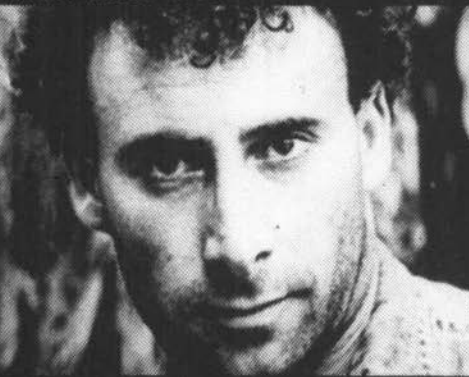
ANTONY SHER SINGER