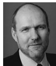
Steve Walt, Harvard University